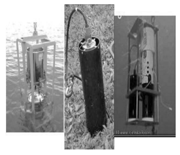
Fig. 1. Samples of currently available deployable systems that can be used in situ to sense conditions associated with potential CHAB events. 1). Flow Cam system from Fluid Imaging Technologies can identify cell type in situ. 2). Fluoroprobe system can identify water column phytoplankton based on a combination of 6 different fluorescence signatures. 3). NAS nutrient analyzer can detect in situ biogeochemical shifts that can be linked to pending CHAB events. (See Color Plate 7).