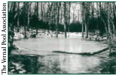
The Vernal Pool Association

Many vernal pools fill with water in fall or spring.