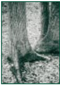
Trees found in swamps are sometimes buttressed at the base, which helps anchor them in the saturated soils.

SWAMPS are fed primarily by surface water inputs and are dominated by trees and shrubs. Swamps occur in either freshwater or saltwater floodplains. They are characterized by very wet soils during the growing season and standing water during certain times of the year. Well-known swamps include Georgia's Okefenokee Swamp and Virginia's Great Dismal Swamp. Swamps are classified as forested, shrub, or mangrove.