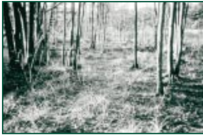
Forested swamps serve a critical role in the watershed by reducing the risk and severity of flooding to downstream areas.

Forested swamps are found in broad floodplains of the northeast, southeast, and south-central United States and receive floodwater from nearby rivers and streams. Common deciduous trees found in these areas include bald cypress, water tupelo, swamp white oak, and red maple.