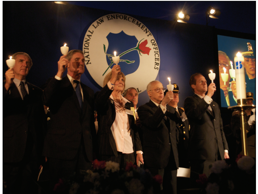
On May 13, 2008, Attorney General Mukasey, pictured above with senior law enforcement officials, delivered the keynote address at the National Law Enforcement Officers Memorial Fund's 20th Annual Candlelight Vigil at the National Law Enforcement Officers Memorial in Washington, D.C.