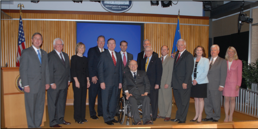
On May 22, 2008, Attorney General Mukasey participated in the Executive Working Group on Prosecutorial Relations meeting hosted by the Department of Justice.

The Executive Working Group on Prosecutorial Relations (EWG) met on May 22, 2008, to discuss issues of common concern to prosecutors at the federal, state and local level on the topic of public corruption.