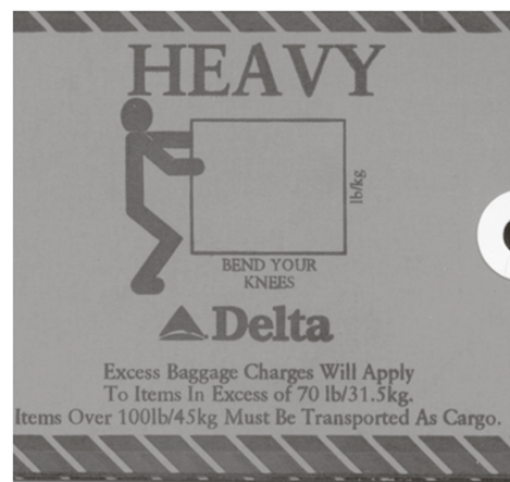
Figure 3-1.4 Airline baggage warning tag