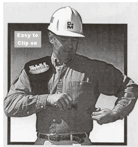
Figure 3-1.6 Shoulderguard for carrying