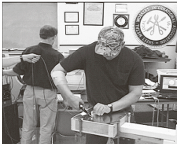
Figure 3-3.1. Measuring muscle activity

We just completed data collection on different designs of tin snips. Rather than say that these are ergonomically designed, we are looking at changes in grip force, and how the tool is used, and whether there are more or fewer deviations of the wrist, and whether or not it is more comfortable. We are working with Midwest Tool to determine the effectiveness of ergonomically designed hand tools for the construction trades.