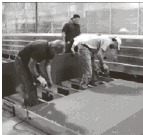
Figure 3-2.2. Modularizing sheet rock

Figure 3-2.2 is a picture of modularizing sheet rock, an upstream idea. These people went to 2 x 8's; usually it is 4 x 12's.