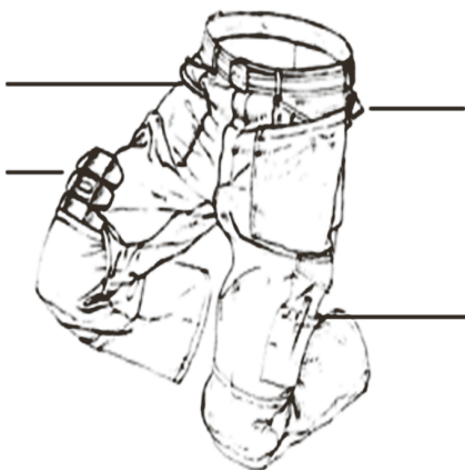
Figure 3-1.5 Snickers kneepad pants

How then do we evaluate these solutions to see if they are really helpful or not? That is the area where we are lacking. We need to see which solutions are best and then publicize that information. NIOSH wants to do with that with the control technology assistance for the construction industry project.