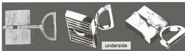
Figure 3-1.3 Magnetic sheet lifters

Kneepad pants have a pocket in the pants leg for the pads. They are not very expensive and work pretty well. Figure 3-1.5 shows a picture of Snickers kneepad pants. Shoulder pads are available for carrying materials on the shoulders. Shoulders are a nice way to carry things, because the