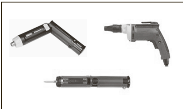
Figure 3-1.1 Substitute powered/cordless screw-guns

Power Tool Instead of a Hand Tool: As batteries get lighter, smaller, and stronger, it is easier to switch to power tools. Using scissor lifts for overhead work is becoming much more common. Workers can substitute powered or cordless screw guns, instead of hand-cranking (Figure 3-1.1). These tools are very inexpensive now. It does not change the skill of the job; it just makes it easier. Five or ten years ago, these tools were not being used. When they became less expensive, they became more widely used in the industry.