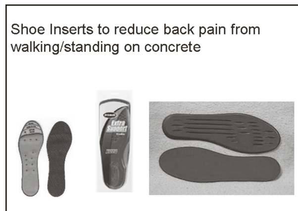
Figure 3-1.7 Shoe inserts

I've thought about what evidence you would need to show that a kneepad will