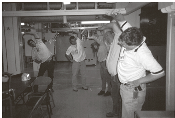
Figure 3-1.8 Work crew performing stretching exercises