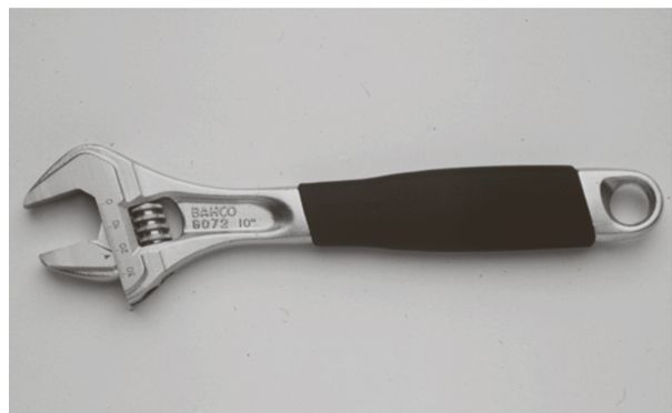
Figure 3-1.2 Ergonomically designed wrench

Figure 3-1.3 shows magnetic sheet lifters for moving sheet metal. The worker can attach the lifter and carry the sheet metal much more easily.