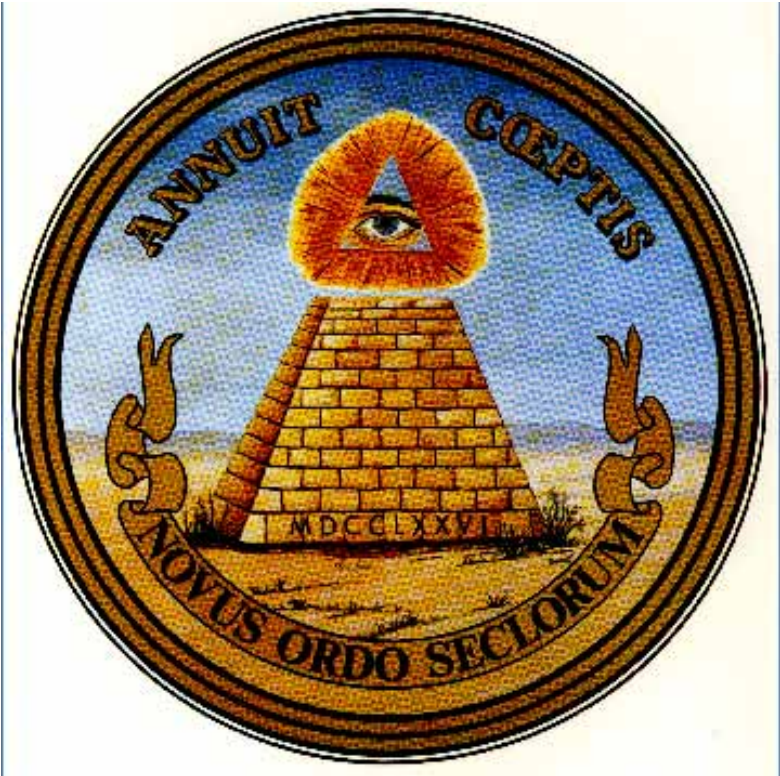
Reverse Side of the Great Seal