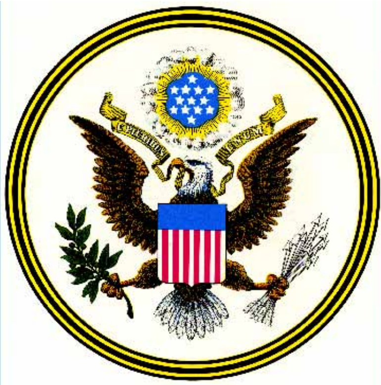
Obverse Side of the Great Seal