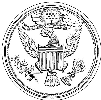
Great Seal of 1841, engraved in steel by John Peter Van Ness Throop of Washington, DC. It departed from 1782 design by showing only six arrows in eagle's claw and by giving stars five, rather than six, points. It also added fruit to olive branch.