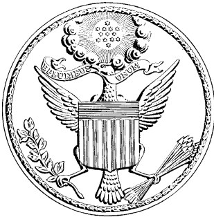
First Great Seal, possibly engraved by Robert Scot of Philadelphia in 1782. Brass die of seal was in use almost 60 years.