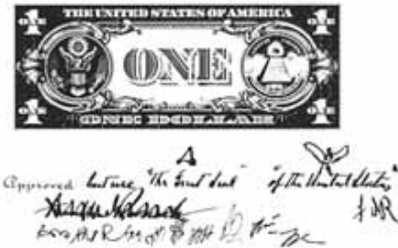
Model of back of 1935 dollar bill submitted to President Franklin Roosevelt for approval. The President changed his mind after approving it, reversed placement of obverse and reverse and added legend “The Great Seal of the United States” in two parts under his roughly sketched pyramid and eagle.

The seal is also affixed to the envelopes that contain letters accrediting and recalling our ambassadors and other ceremonial communications from the President to heads of foreign governments.