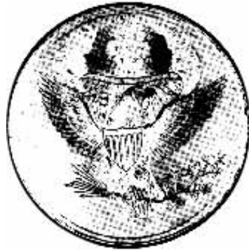
Masi Treaty-Seal Die of 1825, used for pendant seals impressed in wax and enclosed in gold or silver boxes, then fastened with ornamental cords and tassels to treaties.

on the branch of an olive tree. He clearly defined 13 arrows, made the shield narrower and more pointed and altered its crest, and centered the motto E Pluribus Unum over the eagle's head. This beautiful seal was used for treaties until 1871, when the government ceased using pendant seals and retired the die. It is available for viewing in the National Archives. □