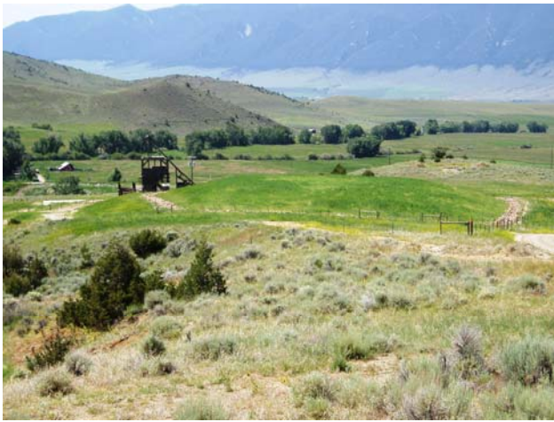
Buckeye Mine & Mill , photos above and below June 2007 (reclamation completed) showing constructed repositories used for containment of mine wastes