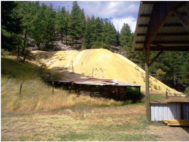
Big Chief Mine , photos above & below August 2005 (before reclamation) showing piles of mine wastes