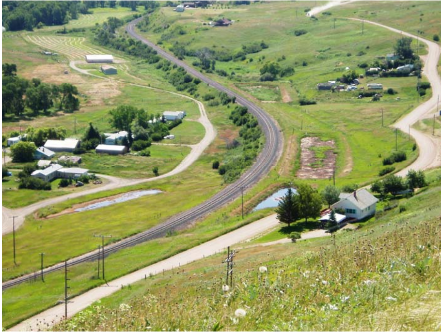
Belt Creek below Anaconda Coal Mine, all photos June 2007 showing previous attempts to remediate acid mine drainage in the Great Falls/Lewiston Coal Field