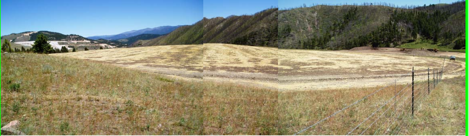
Washington Repository , photos above June 2007 (nearing completion) showing final surface cap of constructed repository for permanent disposal of mine & mill wastes from Washington Mine & Mill project and other nearby projects