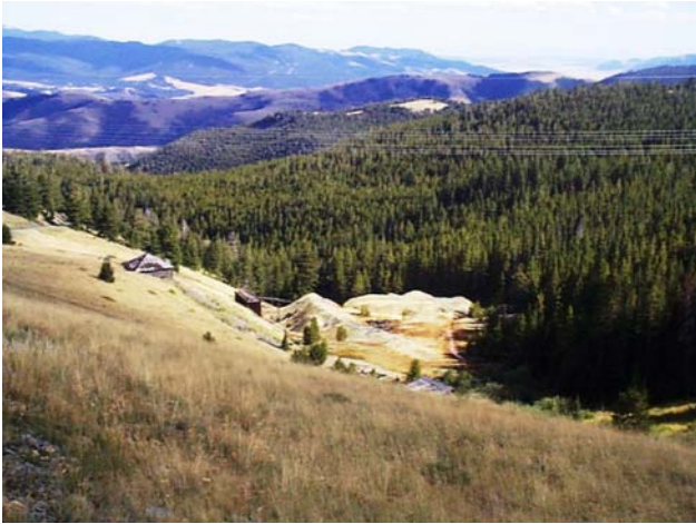
Bluebird Mine & Mill , photos above & below August 2005 (before reclamation) showing acid mine drainage, piles of mine wastes

The following photographs have been attached to this report to further demonstrate the degree of hazardous conditions encountered in various areas of the State, and the excellent reclamation accomplished by the MWCBC to eliminate the hazards.