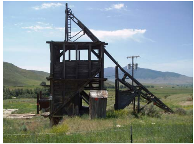
Buckeye Mine & Mill , photos above and below June 2007 (reclamation completed) showing remnants of mining and milling retained for historic significance