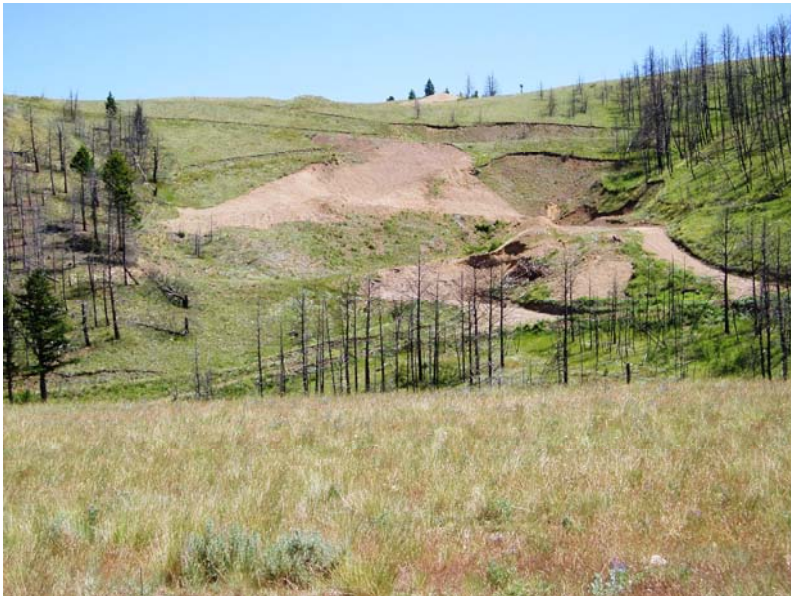
Belle Lode Mine , photo June 2007 (during reclamation) showing removal of mine wastes