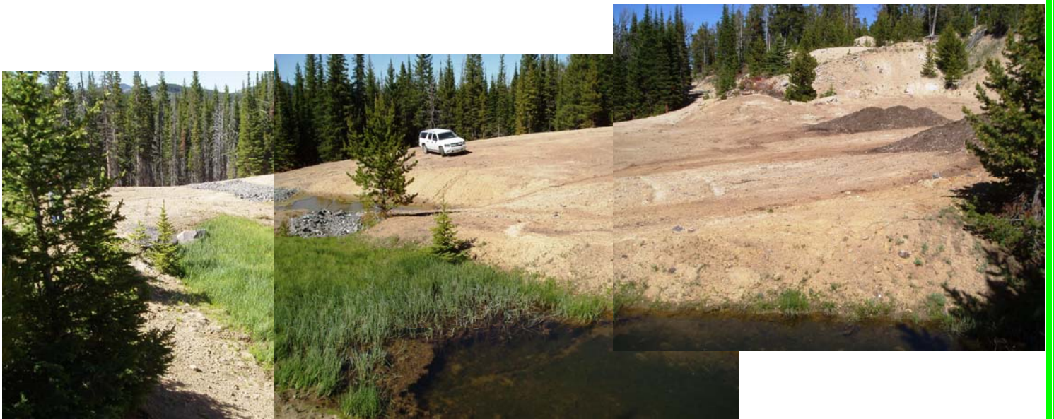
Argentine Mine , photos above & below June 2007 (reclamation nearing completion) showing mine waste piles removed, areas regraded, drainage channel reestablished, utilization of filter fabric to retain sediments on-site