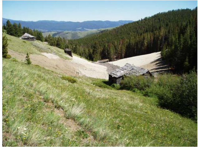
Bluebird Mine & Mill photos above & below June 2007 (reclamation nearing completion) showing slight trace of acid mine drainage at head of channel, mine wastes piles removed