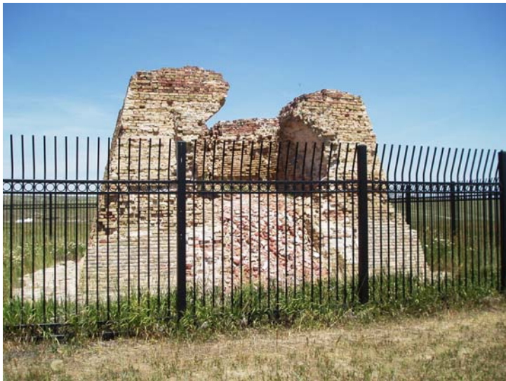
Montana Silver Smelter all photos June 2007 (reclamation completed 2005) after removal of mineral processing wastes; base of historic smelting stacks retained as interpretive site, cultural remnants uncovered during reclamation retained for preservation purposes, adjacent Giant Springs State Park along banks of Missouri River