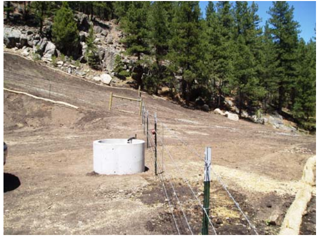
Big Chief Mine , photos above & below June 2007 (reclamation nearing completion) showing mine wastes piles removed, areas regraded, drainage channel reestablished