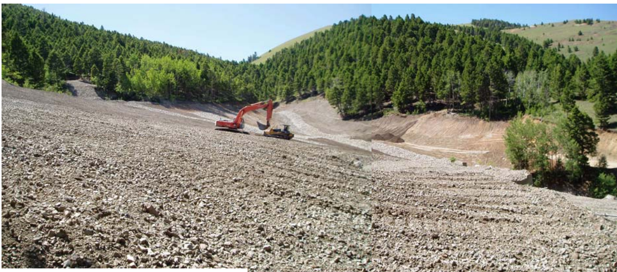
Washington Mine & Mill , photos left & below June 2007 (during reclamation) showing mill foundation, mine & mill wastes and hazardous equipment and facilities removal, stream channel reconstruction