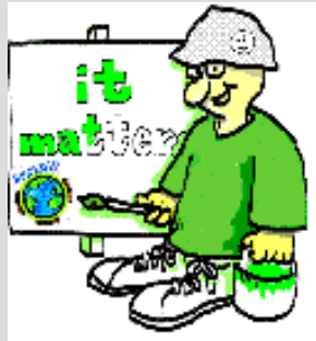
Seymour Green, the ES&H mascot, promotes recycling

Divisions, sections and centers are responsible for transporting collected batteries to the Property Group at Warehouse 2, which serves as the collection point prior to offsite transport for recycling. Each division, section or center must complete