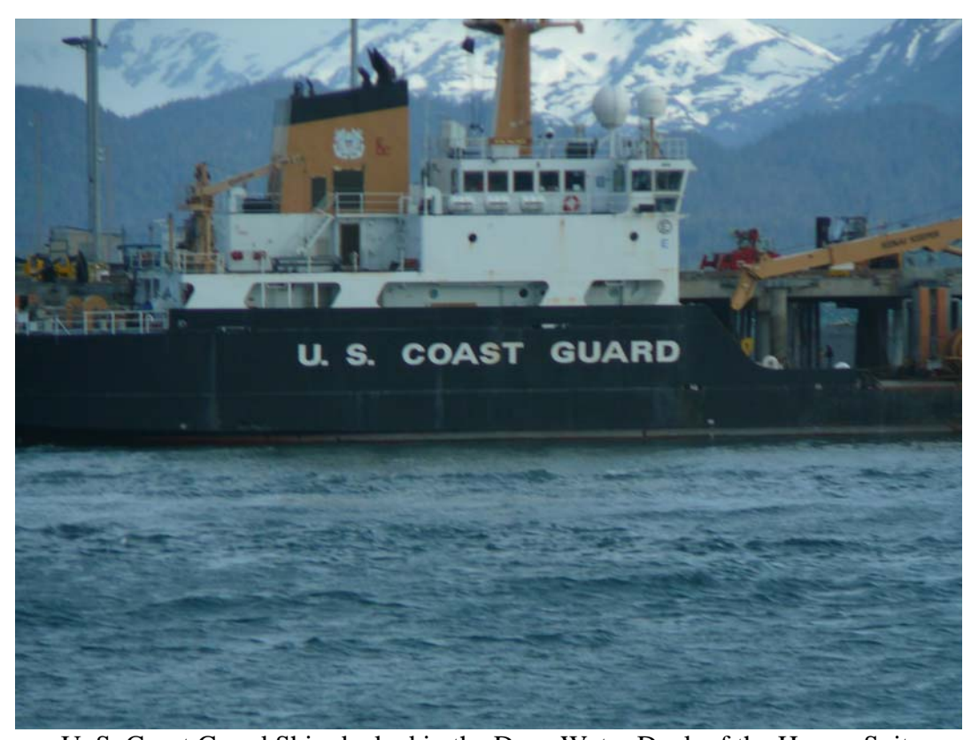
U. S. Coast Guard Ship docked in the Deep Water Dock of the Homer Spit.

I have already seen some gorgeous scenery, including the Canadian Rocky Mountains, Glacier Bay National Park, Anchorage, and Homer. The flight into Homer was a bit bumpy on such a small plane. There were maybe 15 passengers! I saw a moose as we arrived in Homer in some swampy waters near the coast - no antlers though. The Homer Airport reminded me of my hometown Thomasville Airport – VERY SMALL! The land here is much different than at home. The coast, a sheer drop off from the above plateau, has very muddy "beaches." From the airport, I got a ride with some other scientists boarding the FAIRWEATHER to the Homer Spit. This is the pier where many boats are docked and people camp and vacation. Apparently there is a strip of stores further down the pier - yes, it includes a McDonalds! As we drove into the Deep Water Dock where the ship was located a huge cruise dwarfed the image of the FAIRWEATHER. There was also a US Coast Guard ship at the same dock. Take a look at the pictures below of what I saw on the Deep Water Dock!