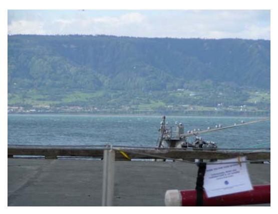
View off the end of the Deep Water Dock looking towards the Homer Airport up on top.