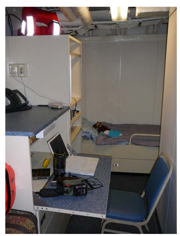
My Stateroom SR C-05-106

The flight across country was long and exhausting. I realized that I would be adding four hours to my day and be very tired if I stayed up late. I retired in my stateroom at about 9:00 pm Alaska time, 1:00 am Pennsylvania time! What a way to start summer vacation! The noise while I slept was deafening, but I was so tired I didn't move until my trusty alarm went off at 7:00 am today. I headed to breakfast and the start of my day!