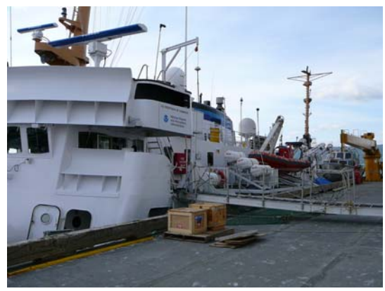
As I prepared to board the ship I quickly snapped a picture of the ramp up to the NOAA ship FAIRWEATHER.