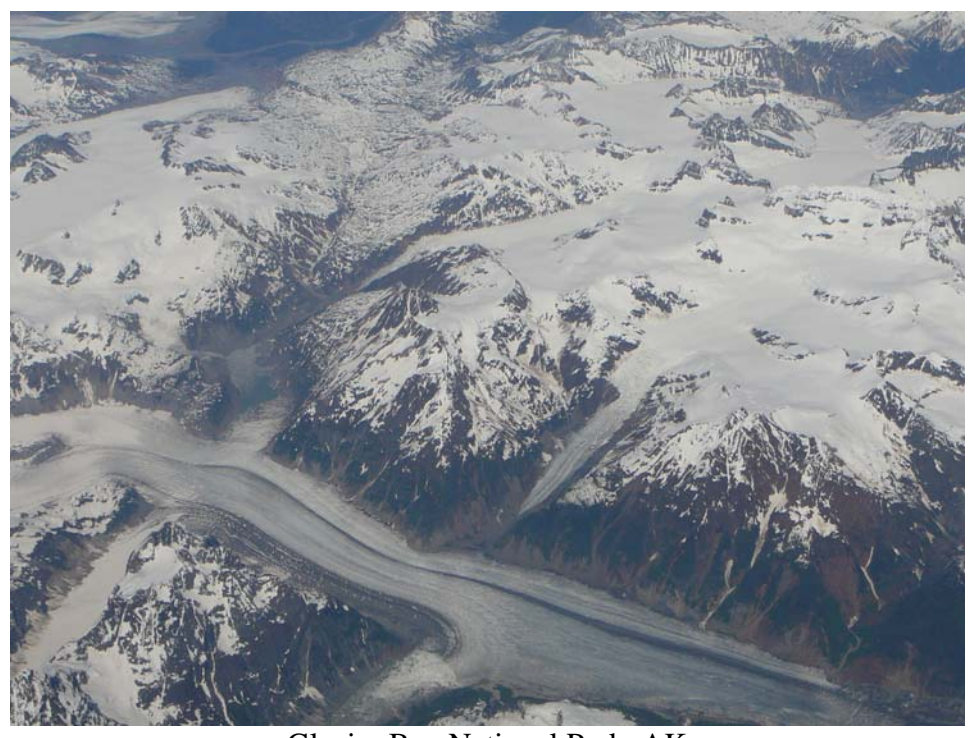
Glacier Bay National Park, AK