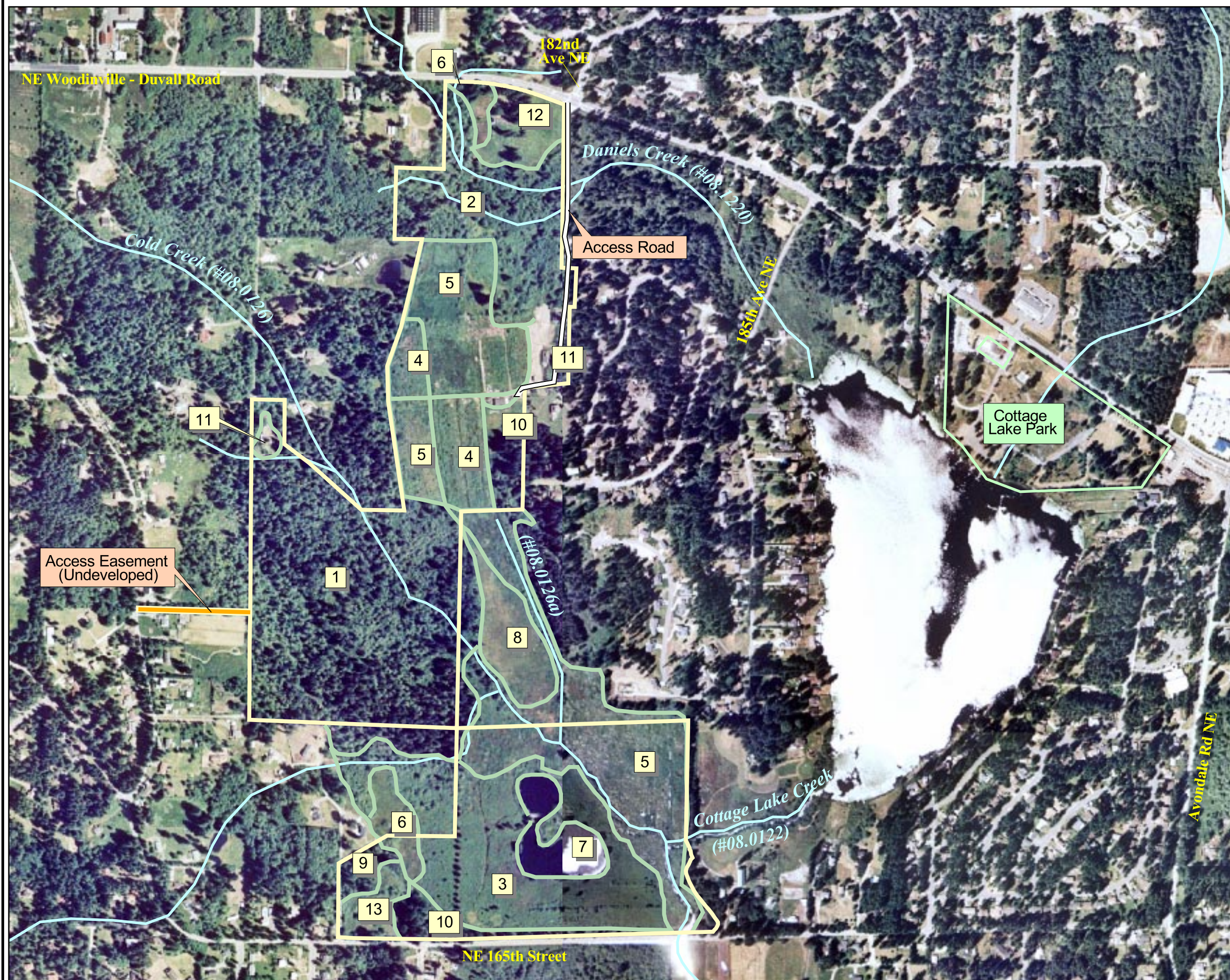
Figure 4 Cold Creek Park Natural Area Natural Resources