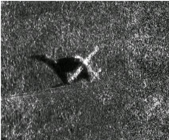
Sonar image of a sunken airplane!

I was being paged because the CO wondered if I'd like to take a boat ride over to Redoubt Lake where the sockeye salmon are spawning. I hurried down to my stateroom to grab some warm clothing and made my way to the fantail (stern of the boat) where the skiffs are tied.