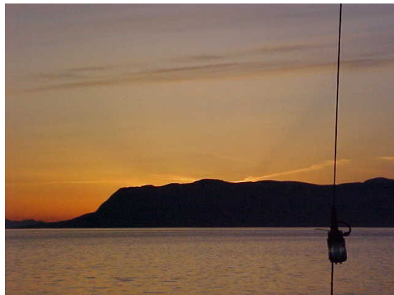
Beautiful sunsets aboard RAINIER!