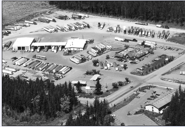
Aerial view of diagonal, pullthrough truck parking facilities.

Survey results also indicated that truck drivers prefer privately-owned truck stops for long-term or overnight parking. The majority of truck drivers and motor carriers rated truck stops favorably, citing more