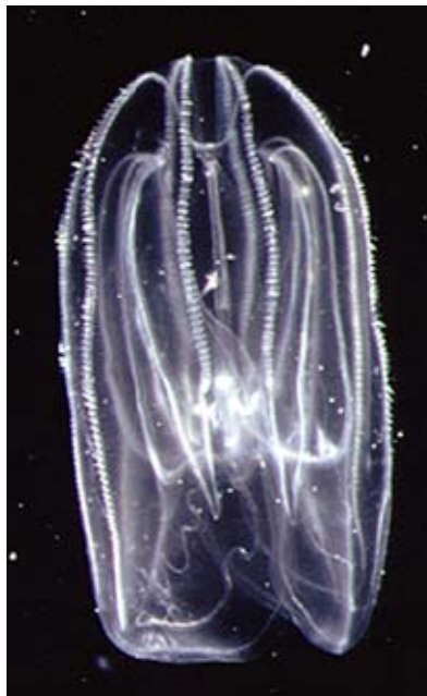
Comb jelly.

◆ A large cargo ship can move and discharge millions of gallons of ballast water and the organisms it contains. The ballast tanks of cargo ships have been identified as the largest single contributor to the global movement of aquatic species.