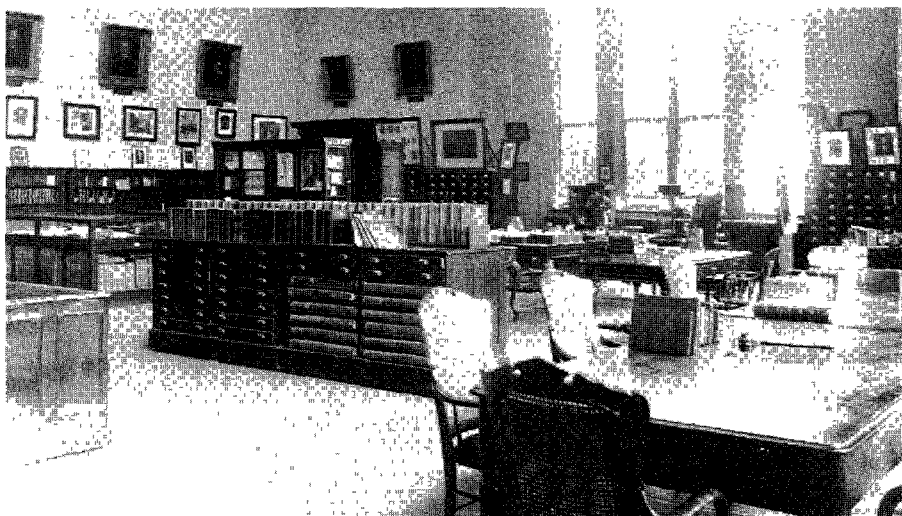
The window end of the reading room, about 1917, photographed from the left end of the card catalog. On the left are exhibit cases. At the center left is the back of the catalog desk.