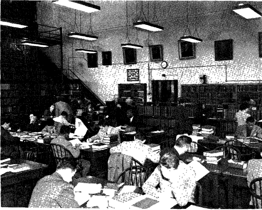
A third of a century later the stack end of the reading room looked like this on an average day.