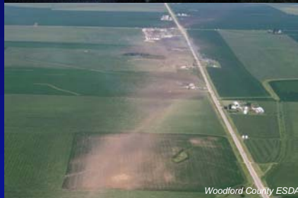
Woodford County ESDA