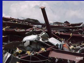
Wreckage from cars in the parking lot was blown into the building by the tornado.

Zero fatalities, and only 3 minor injuries!