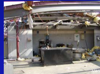
The storm shelters were the only part of the plant to remain intact during the tornado.