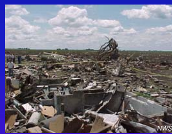
Houses 3/4 mile down the road from the Parsons plant were demolished by the tornado. Steel beams from the plant were found nearby.