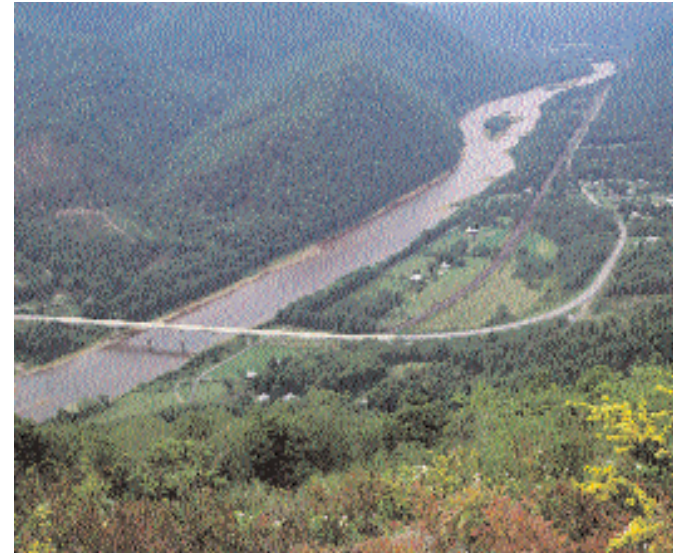
Bridge over the Susquehanna River

PennDOT stipulates that its principal routes be designed to produce 20 years of performance using the 1993 AASHTO Design Procedure. The inputs to this procedure—initial average daily traffic, anticipated traffic growth, desired performance period, and paving material characteristics—generally determine the required pavement design for any paving material.