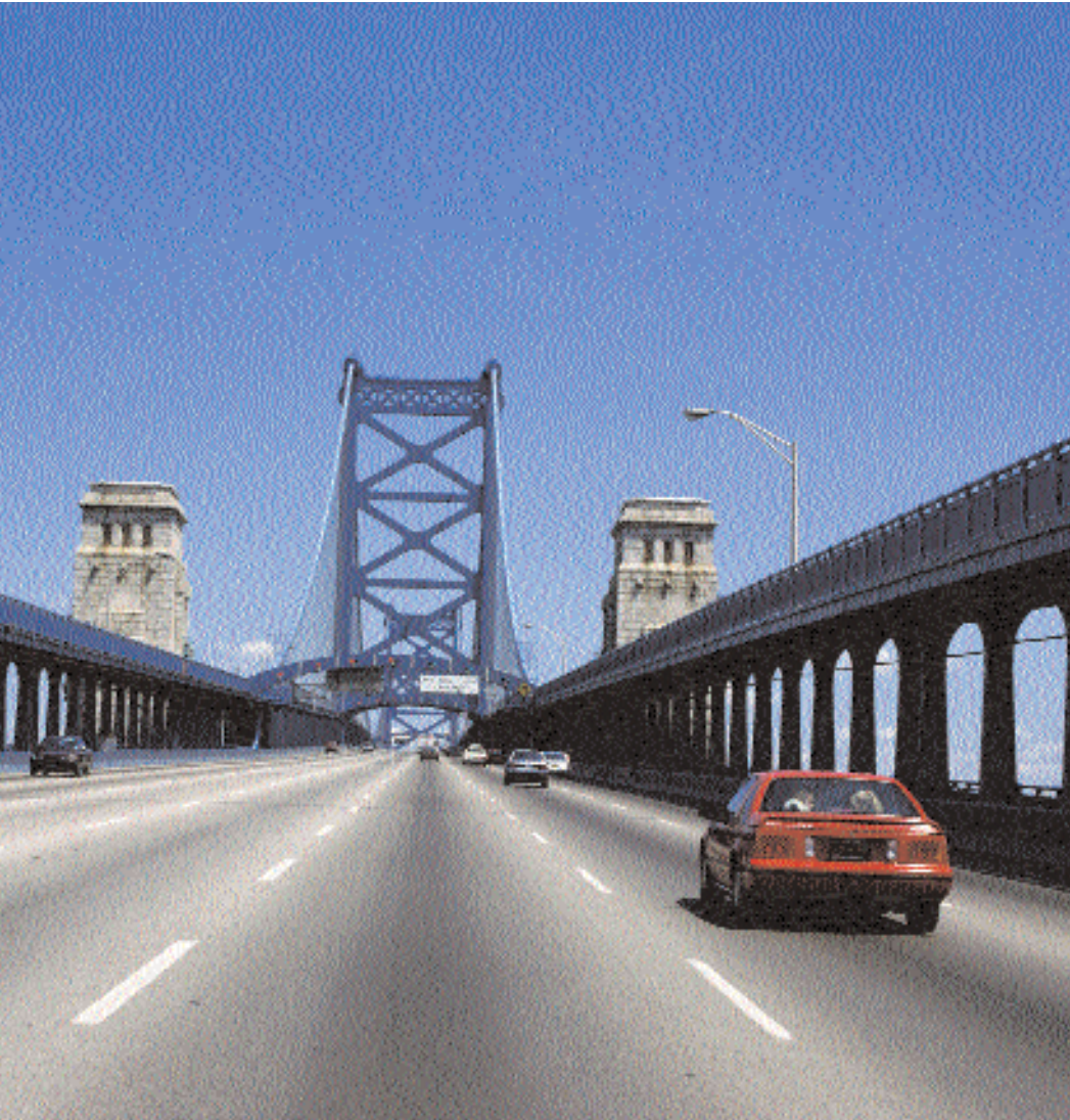
Benjamin Franklin Bridge, Philadelphia