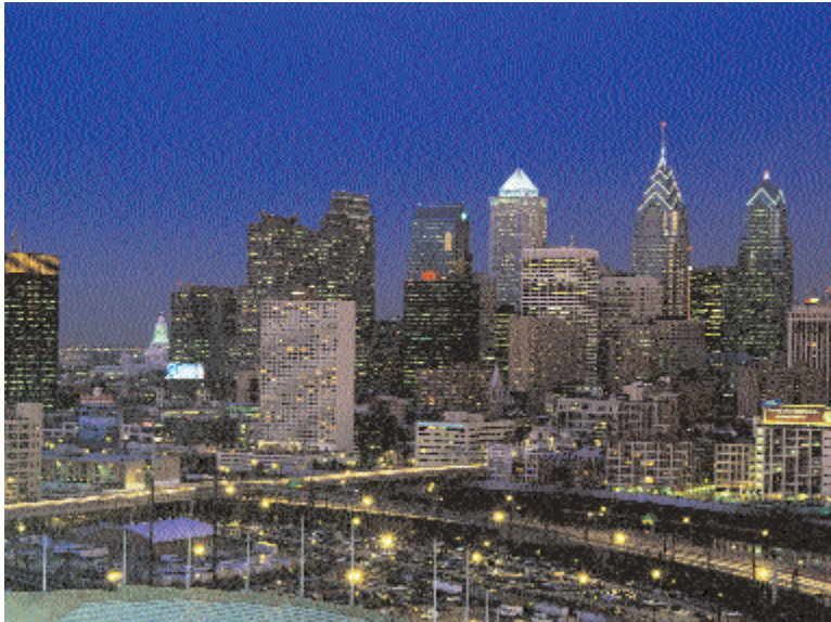
Schuylkill Expressway, southwest Philadelphia

by design, provide similar performance, the only quantified difference in user costs will be due to work zone effects.