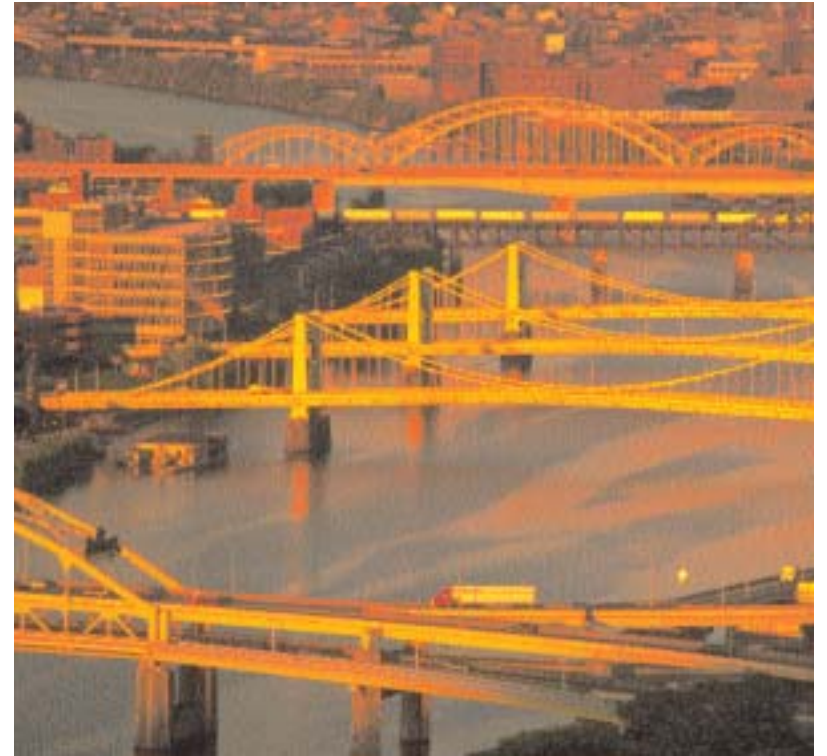
Allegheny bridges, Pittsburgh

PennDOT standardized all pavement design processes, including LCCA, in two manuals: Highway Geometric Design Manual and Pavement Policy Manual .