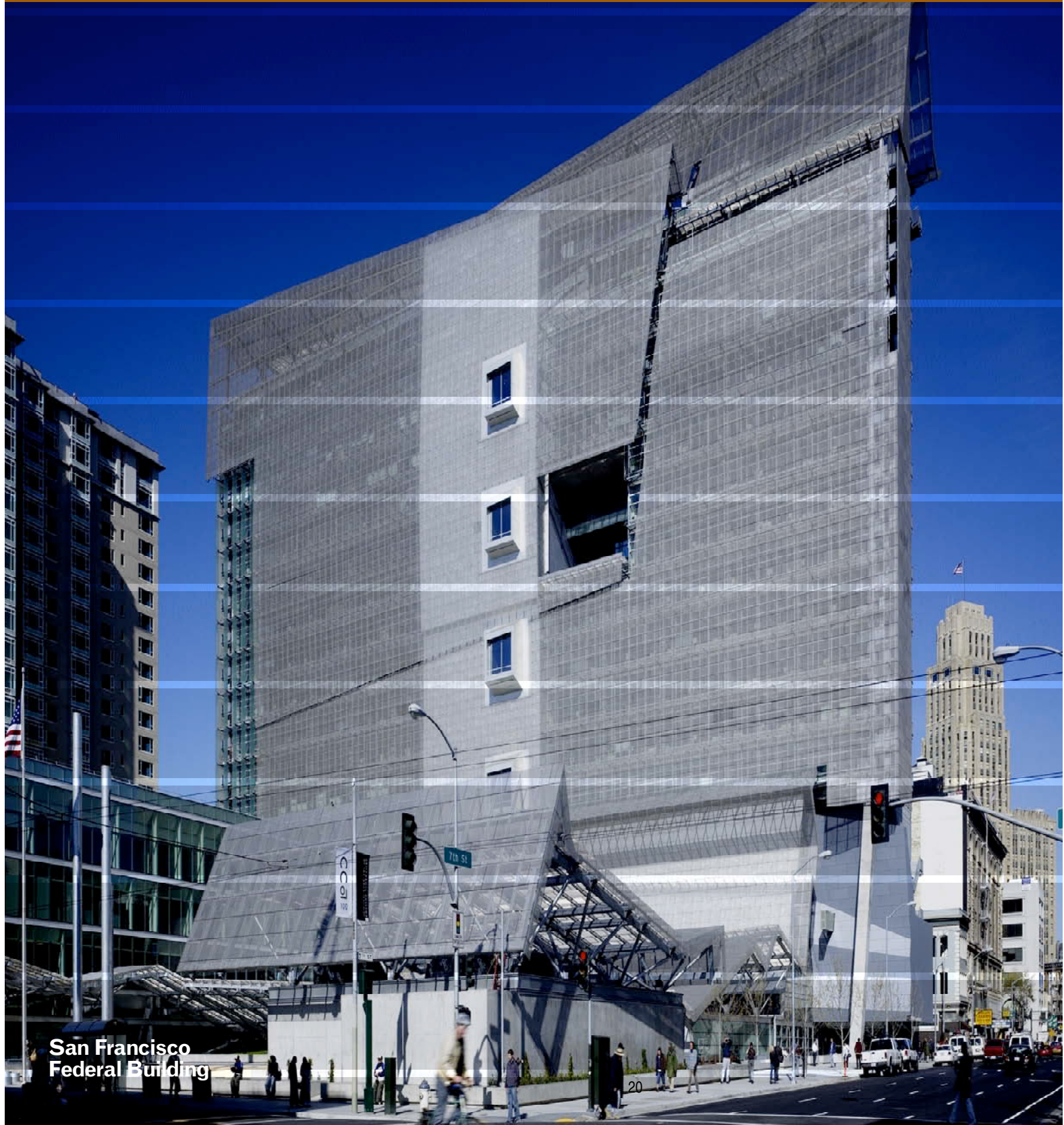
San Francisco Federal Building

This provides the Federal agency leaders, headquarters location and internet address for agencies in the U.S. Government.