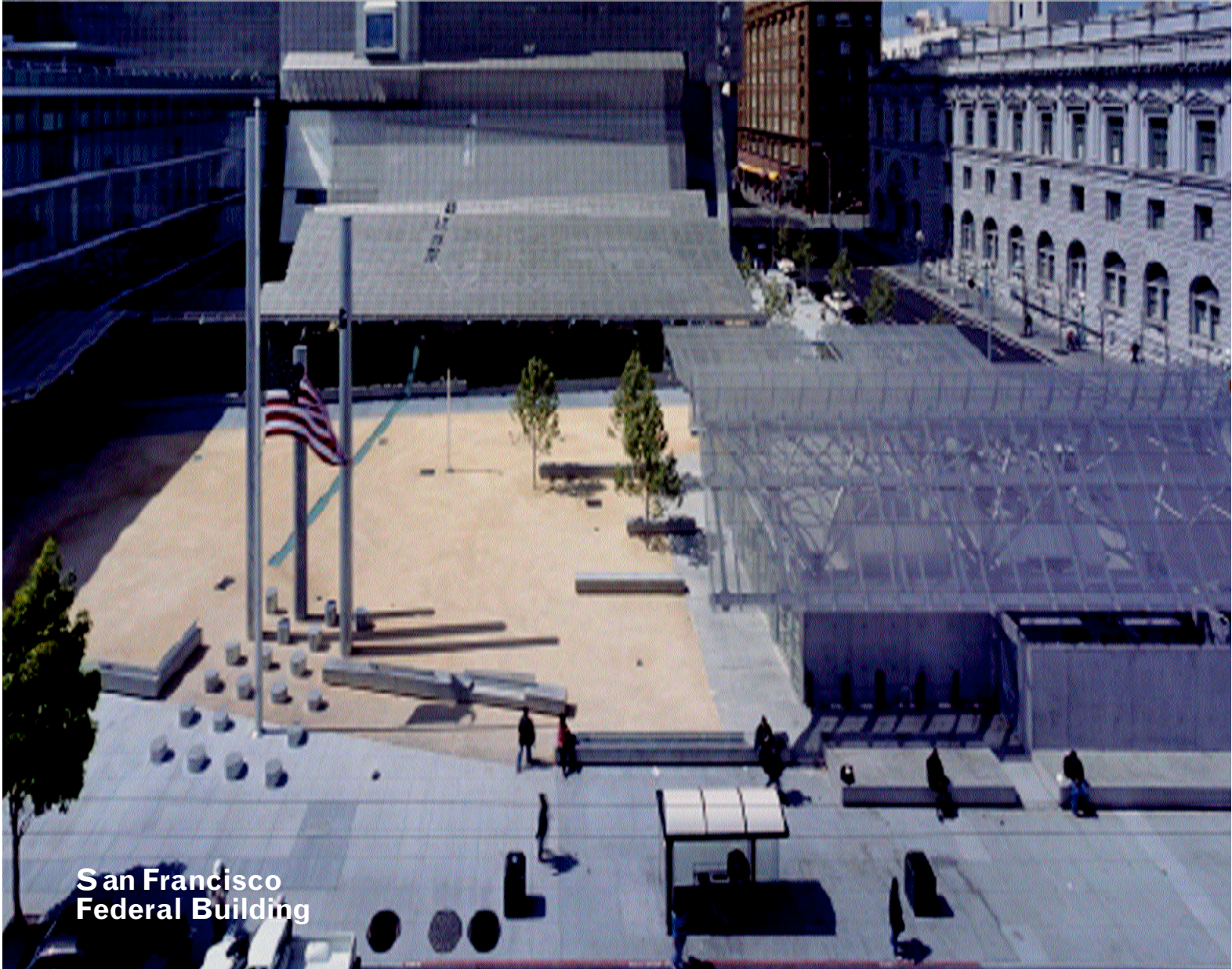
San Francisco Federal Building

Official Business Penalty for Private Use, $300