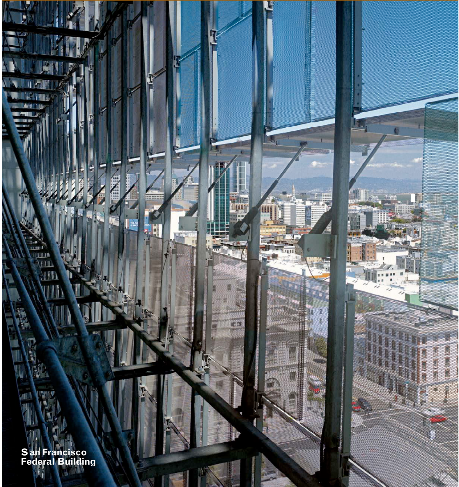
San Francisco Federal Building

The advisory group consists of senior-level representatives from major landholding agencies. It was established to provide a forum for departments and agencies to address policies and views and build a consensus on issues of mutual concern regarding Federal real estate and the workplace.