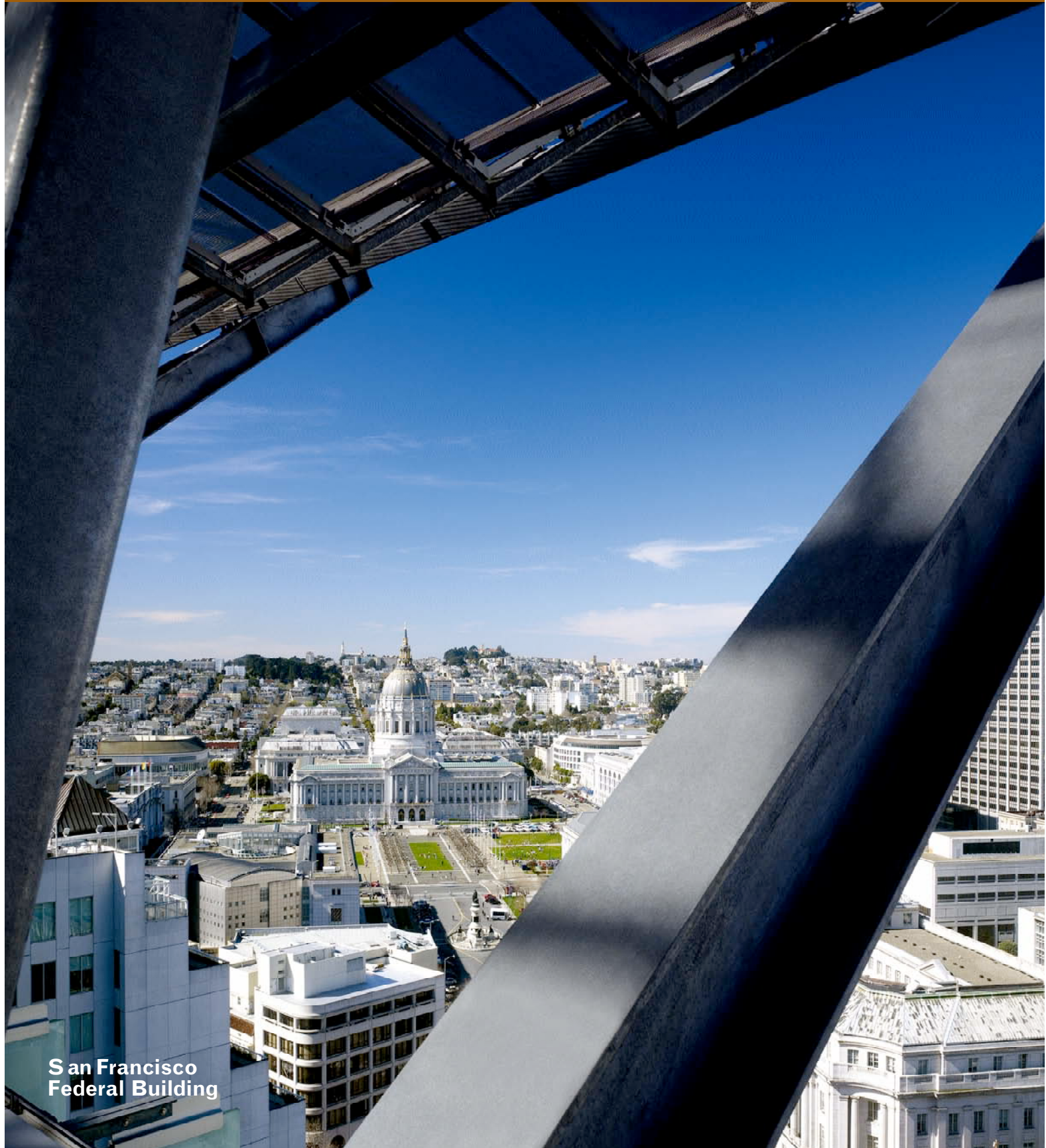
San Francisco Federal Building

This provides the major real estate, workplace, and policy contacts for each Federal agency and its real estate portfolio.