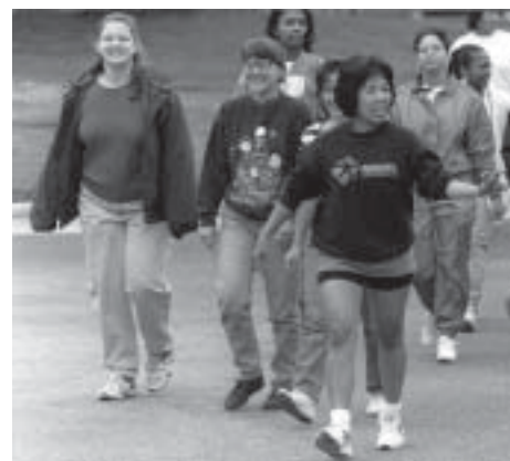
For those not up for a morning run, the 1-mile Fun Walk was the ticket to healthy outdoor activity.