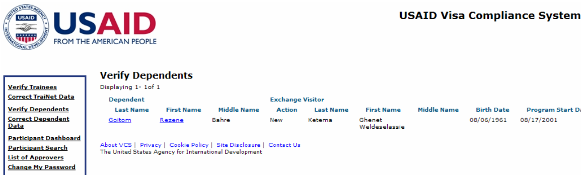
Figure 7: The Verify Dependents Screen contains a list of dependents to be reviewed and verified.

Dependents have their own section of VCS. In the menu on the left of the screen are two dependent options: Verify Dependents and Correct Dependent Data.