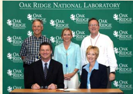
National Resources Management