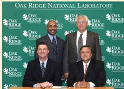
Precision Engineering Contracting Services