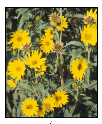
Medicine Creek Germplasm Maximilian Sunflower