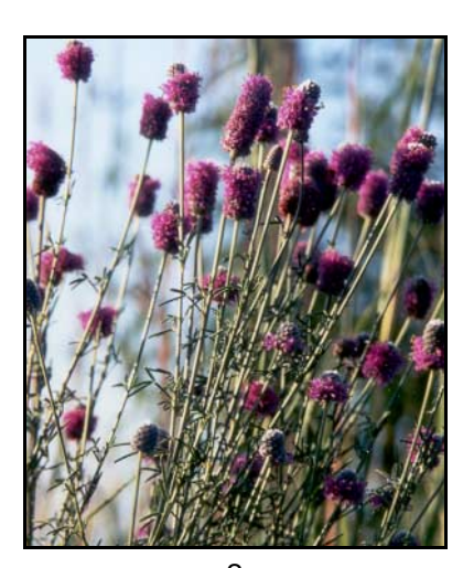
Bismarck Germplasm Purple Prairieclover