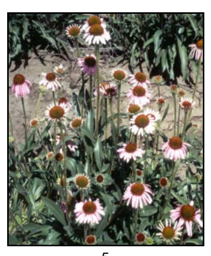
Bismarck Germplasm Narrow-leaved Purple Coneflower