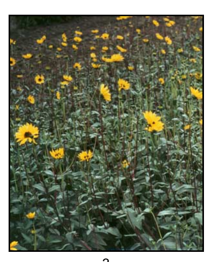
Bismarck Germplasm Stiff Sunflower