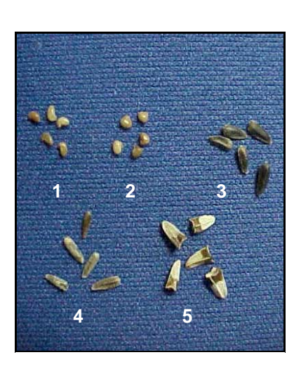
Seed of each Species