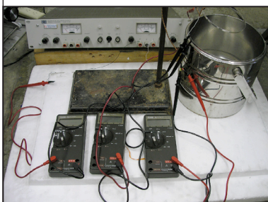
FIGURE 2: Set-up for the three samples that were lowered into a liquid N_2 bath. Resistance was determined using two multimeters (one acting as a voltmeter and ammeter); temperature was measured using a thermocouple which was displayed on a third multimeter.

Fermilab Friends made this project possible, providing stipends to the developers and to the teachers who attended the workshop. FFSE also paid for equipment, including the maglev train, made especially for Fermilab in China.