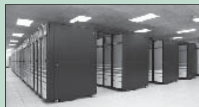
Jaguar, in the Computational Sciences Building

"Your typical house's AC is three tons," the Center for Computational Science's Buddy Bland notes, for comparison's sake.— B. C.