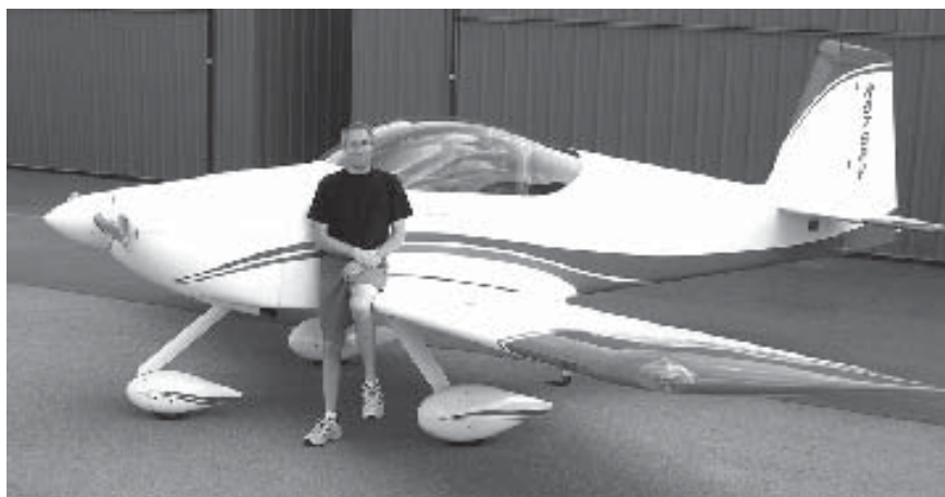
"I'd like for ORNL to be a leader in cost effectiveness."