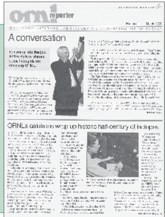
Issue No. 1, March 1999