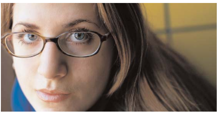
July 1999, Reprinted September 2001, Updated March 2003

Diaphragm/Cervical Cap —A shallow latex cup which the woman puts into her vagina, covering the cervix, before having sex. The diaphragm is generally used with a spermicidal jelly or cream that stops or kills sperm.