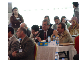
The Iraq National Microfinance Summit occasioned collegial and practical debates.