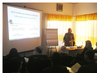
The Small Business Development Center opened in Hilla on November 24th.