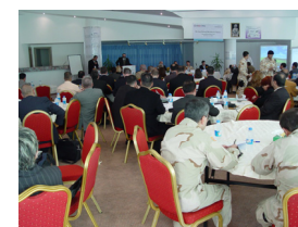
Participants in the Iraq National Microfinance Summit attend the opening session.

For additional information: www.izdihar-iraq.com communications@izdihar-iraq.com www.usaid.gov/iraq