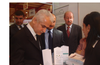
Officials of the Government of Kurdistan Region visit IZDIHAR's booth at the Trade Show.