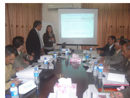
Members of the Trade Policy and Market Access Team of IZDIHAR delivered the course on intellectual property rights.

the northern part of Iraq. The business community, intellectuals, authors, singers and artists of the region have all expressed a strong interest in having this kind of training.