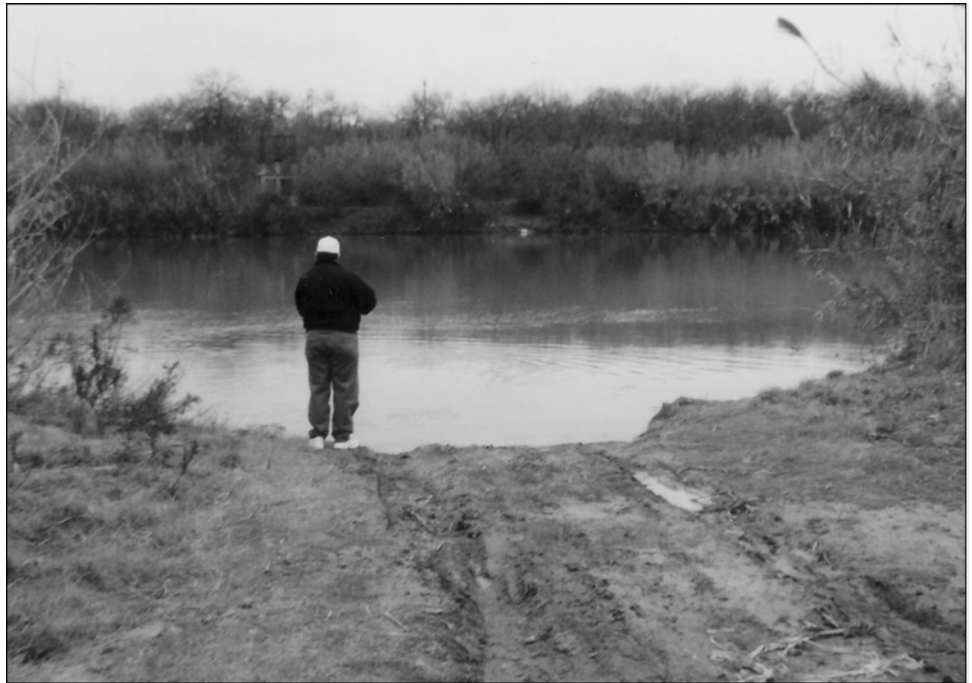
Figure 4: GAO Investigator at a U.S.–Mexico Border Location