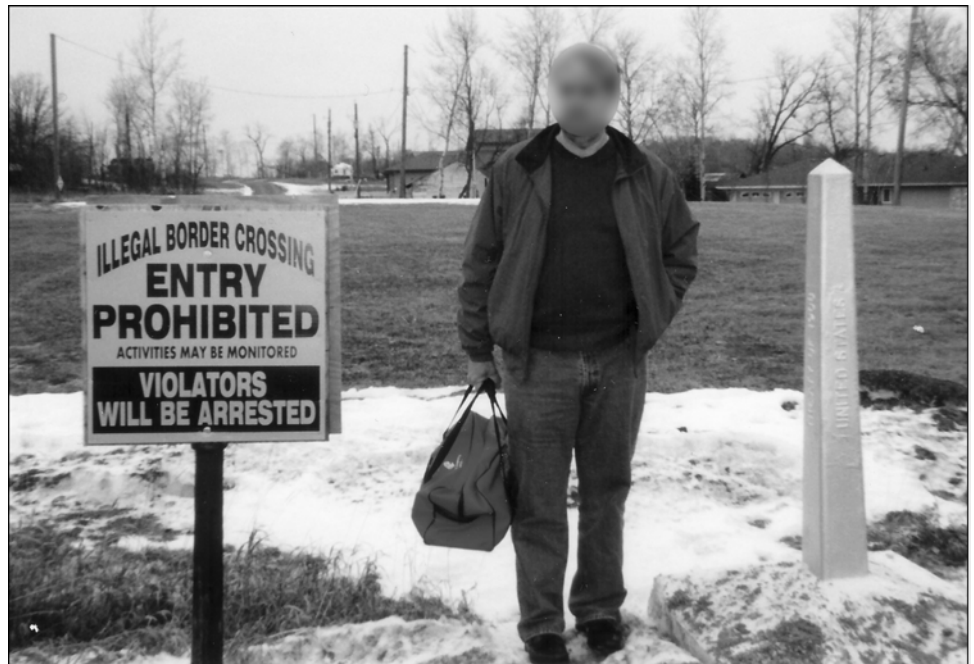
Figure 2: GAO Investigator Crossing from Canada into the United States in Northern Border Location Three

On November 15, 2006, our investigators visited an area in this state where state roads ended at the U.S.–Canada border. One of our investigators simulated the cross-border movement of radioactive materials or other contraband by crossing the border north into Canada and then returning to the United States (see fig. 2). There did not appear to be any monitoring or intrusion alarm system in place at this location, and there was no U.S. Border Patrol response to our border crossing.