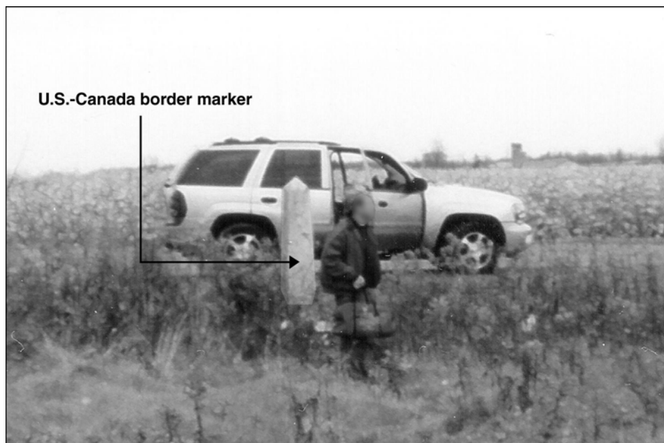
Figure 1: GAO Investigator Crossing from Canada to the United States in Northern Border Location One

the investigators on the U.S. side, and returned to his vehicle on the Canadian side (see fig. 1).