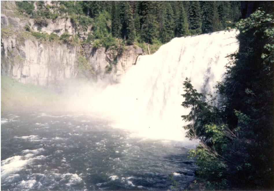
Upper Mesa Falls on the Henrys Fork.