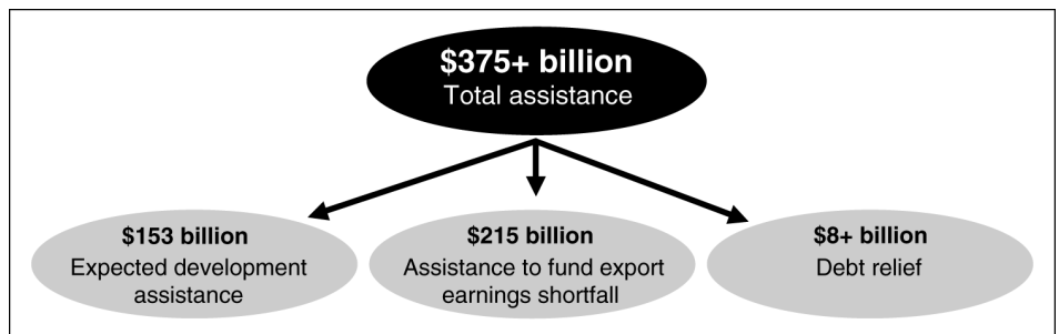
Estimated Cost to Achieve Economic Growth and Debt Relief Targets for 27 Countries through 2020 in 2003 Present Value Terms

Source: GAO analysis of World Bank and IMF data.