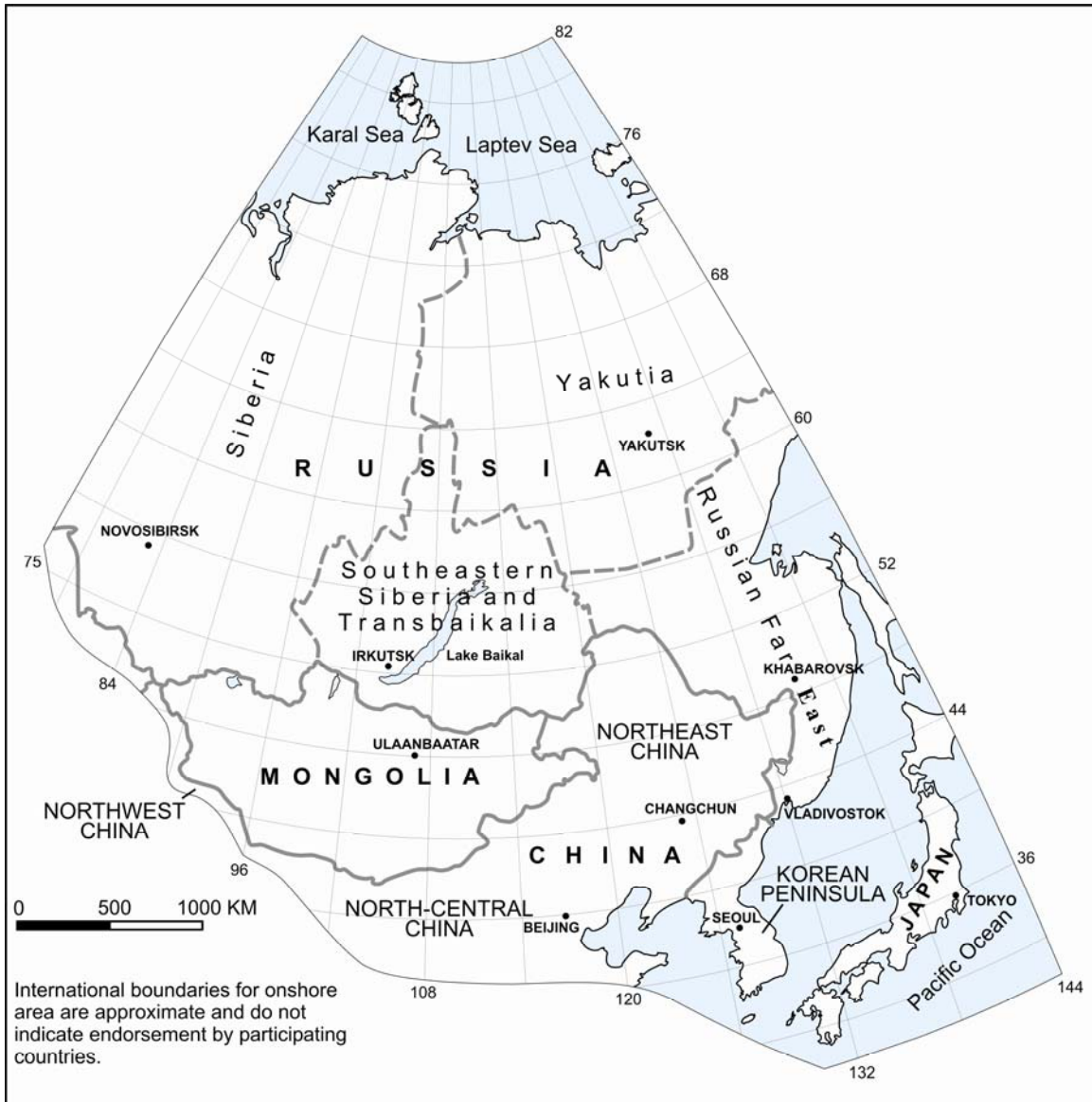
Figure 1. Regional summary geographic map for Northeast Asia showing major regions and countries.