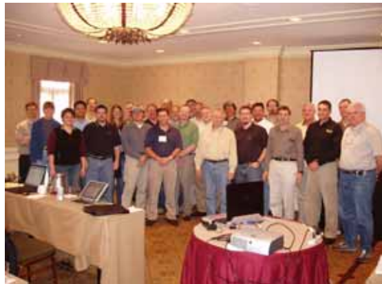
Graduating Class, San Antonio, March 2005

Attendees will receive a certificate of attendance and a copy of the WUFI-ORNL/IBP Software and software keys. You will have a temporary license for WUFI Pro.