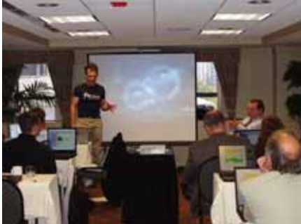
(Chicago, Oct. 2004 Student Exercise)