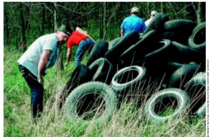
Used tires provide ideal mosquito breeding sites.

The U.S. Geological Survey and the Centers for Disease Control and Prevention are tracking the distribution of the virus in birds, mosquitoes, humans, and other animals. State health departments and university extension personnel may have mosquito control and WNV detection programs for your state.