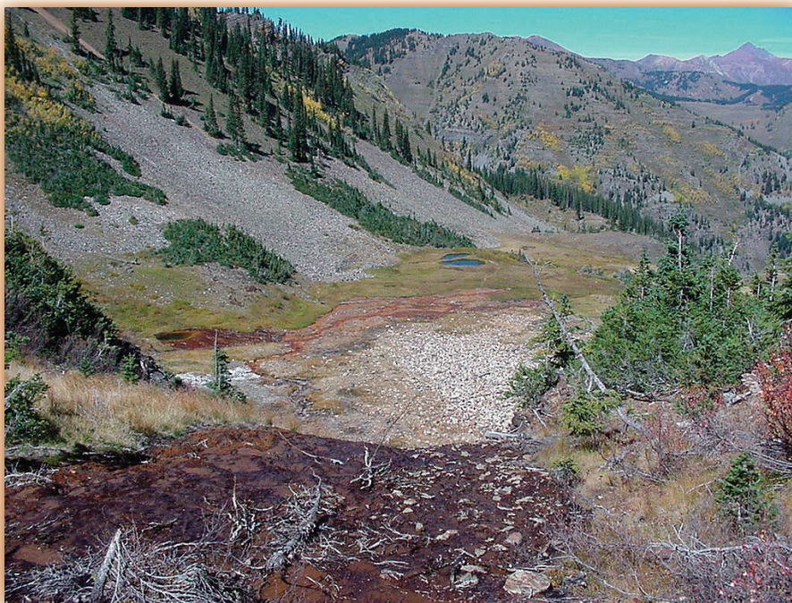
Figure 1. Leached constituents from mineralized areas may affect local streams and biota.

Many other geogenic materials (for example, soils, mineralized rocks, dusts, volcanic ash, and forest-fire ash) may also react chemically with water to produce leachates with increased concentrations of major and trace elements and altered pH. Because of this potential, it is important to have a tool that will aid the environmental