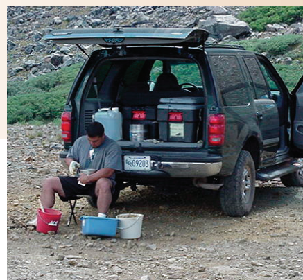
Figure 4. Geoscientist using the USGS FLT to sieve and mix a sample for leaching onsite.

As part of developing the FLT, extensive research and comparative studies were done using many other types of leach tests. After the initial tests, we focused our comparison on studies between the USGS FLT and the EPA Method 1312, Synthetic Precipitation Leaching Procedure (SPLP) (U.S. Environmental Protection Agency, 2002). This comparison was emphasized because the SPLP was