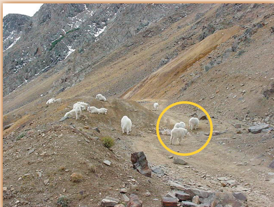
Figure 2. Mountain goats drink rainfall-induced leachate at a historical mine dump in Colorado.

scientist in quantifying and understanding the leachability of geologically derived material and the chemical reactions that can occur when the material comes into contact with water.