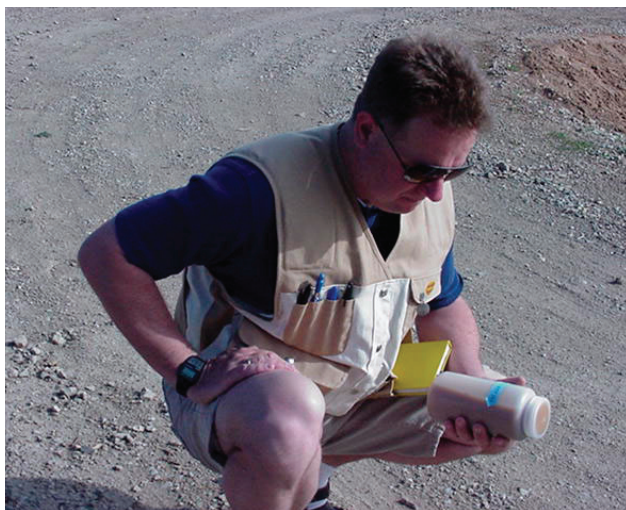
Figure 3. Geoscientist using the USGS FLT to leach a soil sample onsite.

one of the leach tests most commonly used for leaching studies of mine wastes. Complete results of this study are given in Hageman and Briggs (2000).