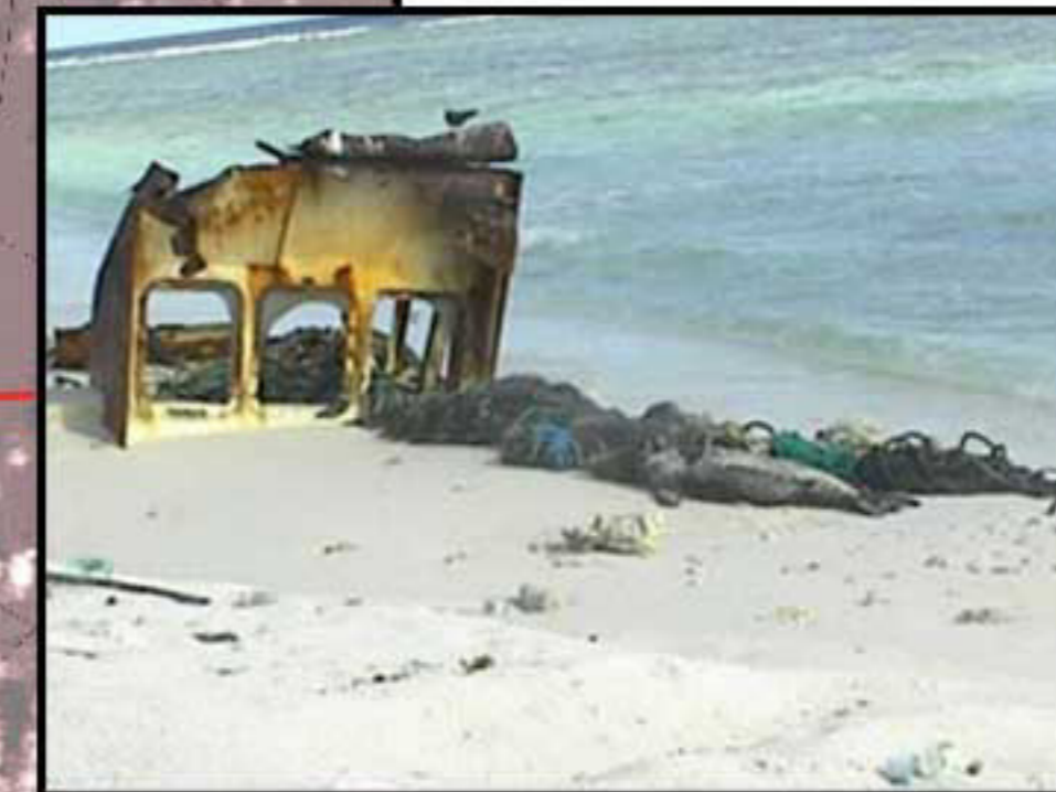
Paradise Queen II ran aground in October, 1998, hull pieces and gear scattered on reef and shore