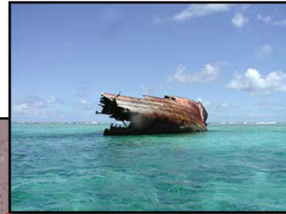
Unknown Vessel reported in 1977, hull piece still on reef