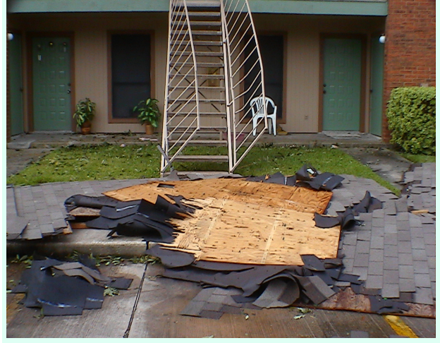
Damage to apartment buildings in Port Arthur, TX

Hurricane Humberto developed extremely rapidly on September 12, 2007, before making landfall along the southwestern Jefferson County, Texas coast as a Category 1 hurricane early on the morning of September 13, 2007. Humberto made history due to its