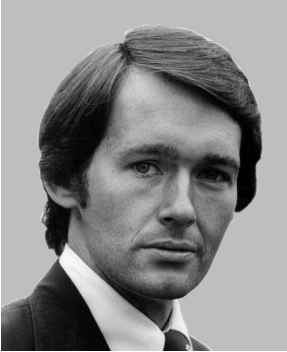
Edward J. Markey of Malden (7th District) Democrat—15th term