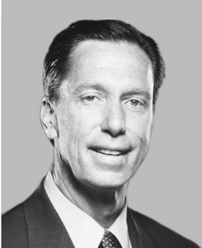
Stephen F. Lynch of South Boston (9th District) Democrat—2d term