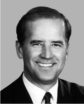
Sen. Joseph R. Biden, Jr. of Wilmington Democrat—Jan. 3, 1973