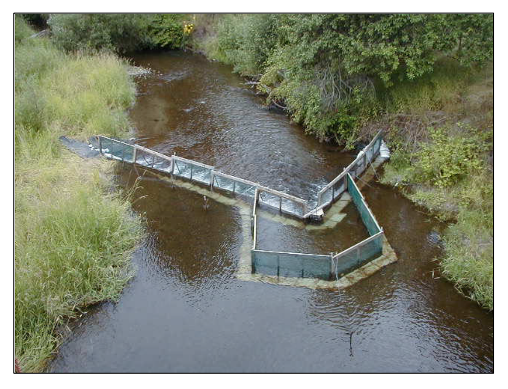
The early-run Issaquah Creek kokanee weir in 2001

Appendix 2. Early-run Kokanee Collection Facility in Issaquah Creek