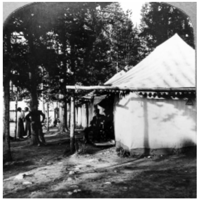
Stereograph of Wylie Camp at Canyon. 1912.