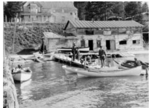
Old Boathouse—Lake. n.d.