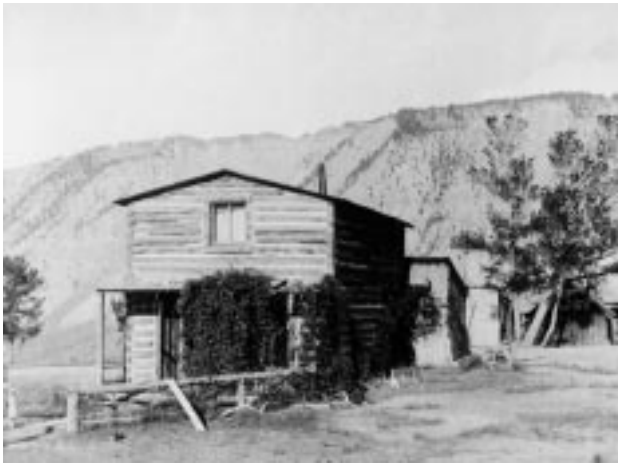
Mail carrier residence. 1917.