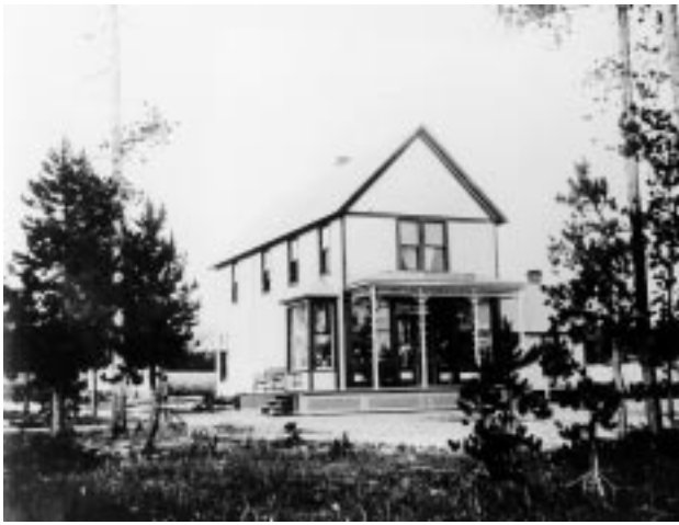
Klamer Store at Upper Geyser Basin. Before 1907.

matter “to a general dump over a cliff above the Gardiner [ sic ] River, opposite the Government ice house.” 31