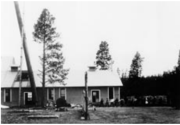
Erecting Lunch Station chimney. 1905.

the end of the season the company instead put its efforts toward getting another site near the geyser basin rather than building on the old site. The lunch stations located on the Grand Loop Road provided a noon-day stop on the scheduled park tours. In addition to the one at Norris, there was a lunch station at Trout Creek, which operated for several years (1888–91). In 1892, it was abandoned when the Old Faithful to West Thumb road was completed, but a new lunch station opened at Thumb. 5 Another lunch station operated from Carroll Hobart’s “shanty hotel” for about 10 years. (The hotel was built in 1884 and burned in 1894.) 6