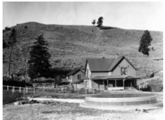
Fountain and Specimen House, Mammoth Hot Springs. ca. 1900.