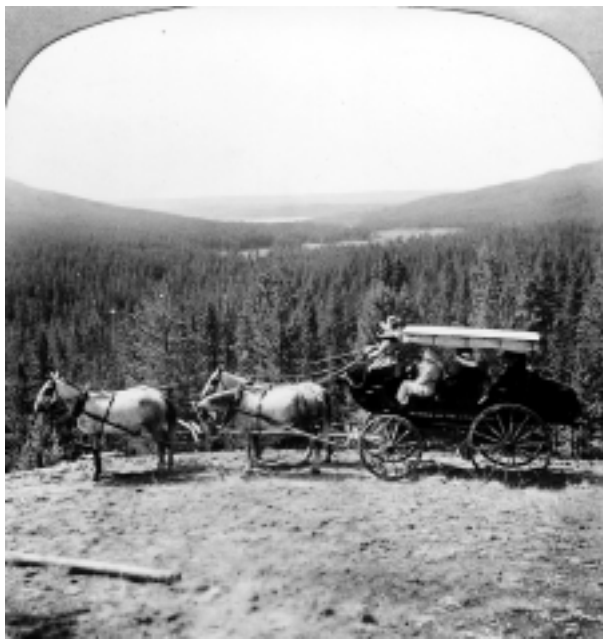
Stereograph of Monida and Yellowstone stage. 1912.