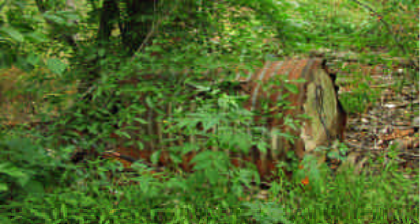
Figure 7. A section of concrete filled culvert located in Wetland 1