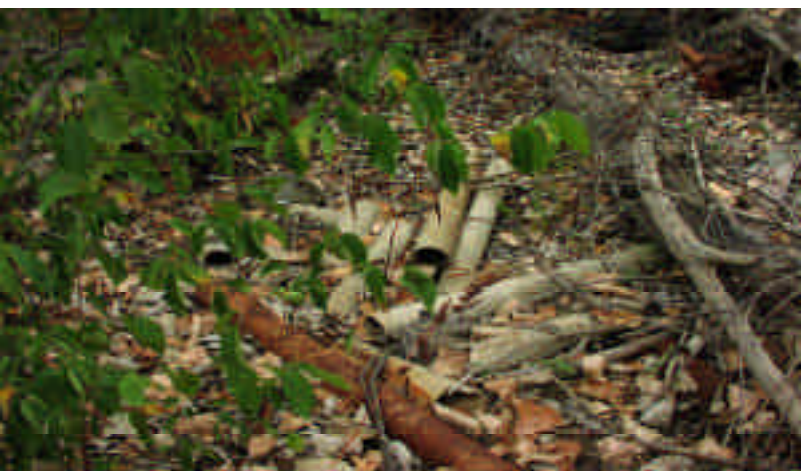
Figure 5. Pile of tan colored pipes containing asbetos