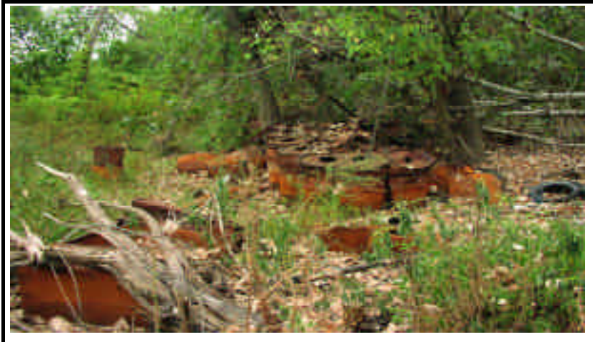
Figure 3. Cluster of approximately 128 drums located in Wetland 1