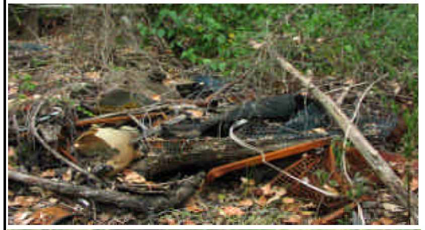
Figure 6. A debris pile located in Wetland