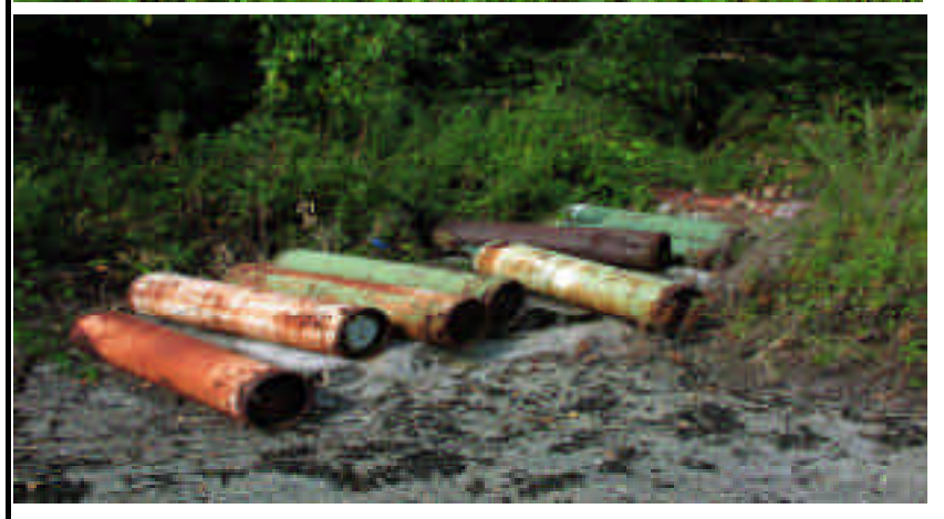
Figure 8. Ten apparently empty, gas cylinders near southern property line of the D.C. Lanham Nursery area