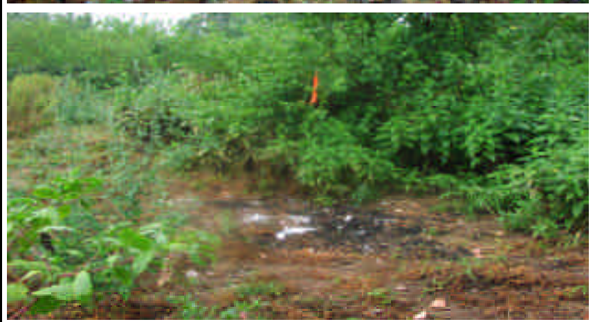
Figure 11. An area in the "meadow" with visibly stressed soil and charred material