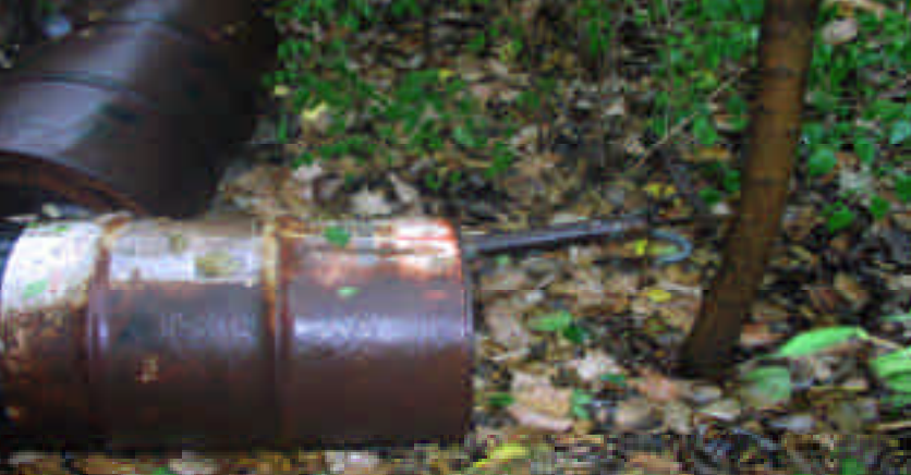
Figure 10. A half full drum with a hand pump attached