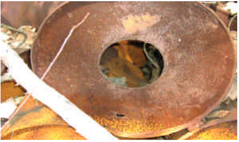
Figure 4. Close up view of a hole in one of the 128 drums located in Wetland 1