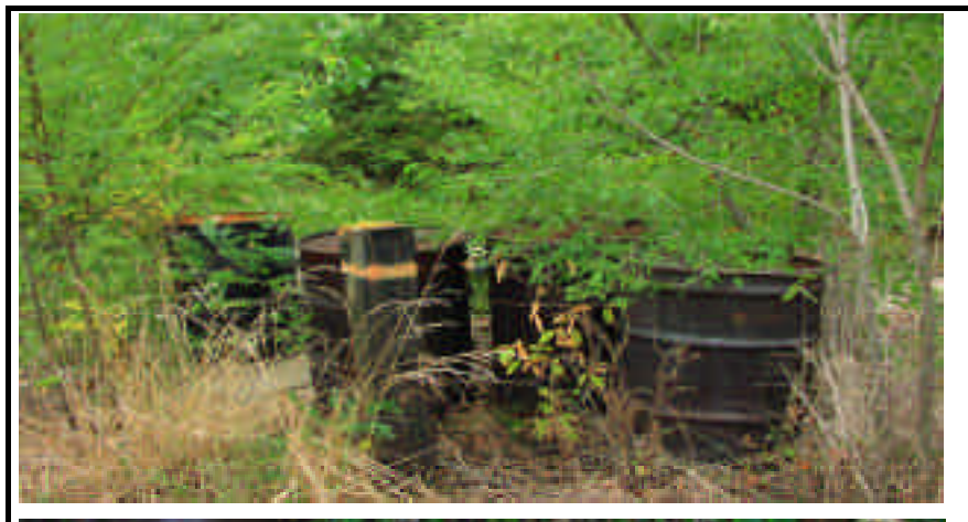
Figure 9. Four drums located near MW-7 containing either soil cuttings or purge water from wells