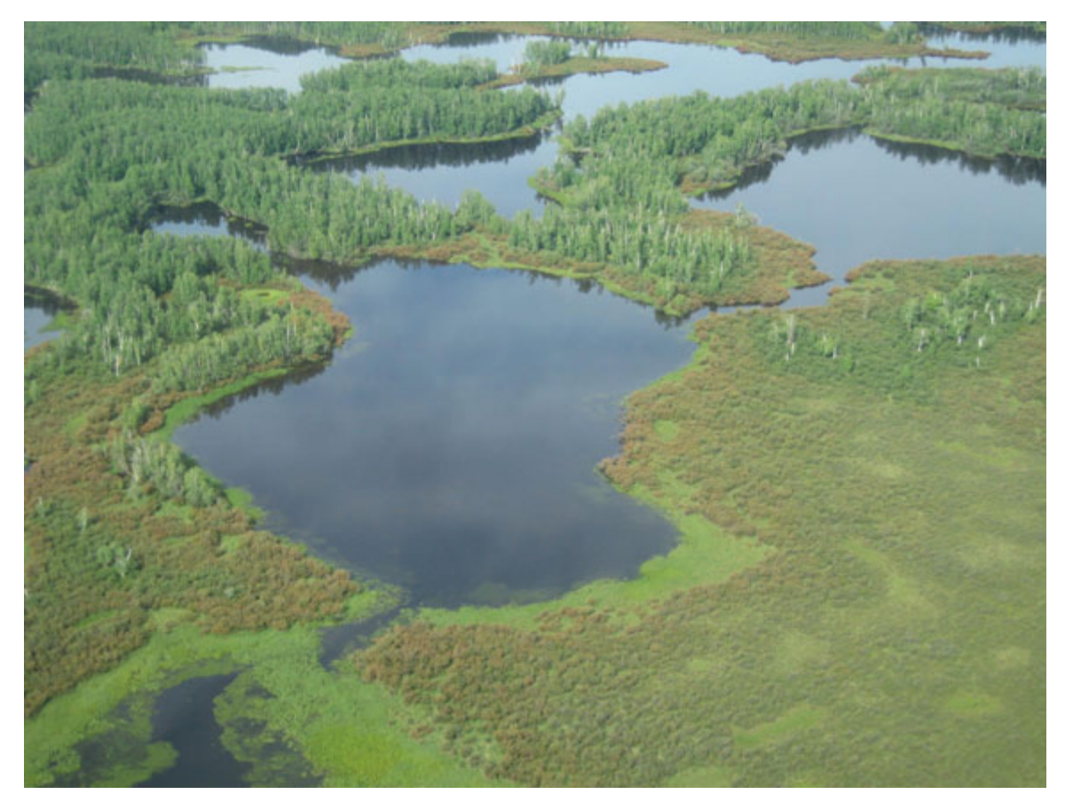
Willow leaf miner was extensive in Alaska's north eastern interior.

State & Private Forestry, Forest Health Protection (FHP), together with Alaska Department of Natural Resources (DNR), conduct annual statewide aerial detection surveys across all land ownerships. In 2007, staff and cooperators identified over 1.2 million acres of forest damage from insects, disease, declines and select abiotic agents (table 1) out of over 38.3 million acres surveyed (map 2). This number underestimates the acres actually affected by pathogens since many of the most destructive disease agents (i.e. wood decay fungi, root diseases, dwarf mistletoe, canker fungi, etc.) are not visible by aerial survey. In fact, nearly every acre of mature Alaskan forests may harbor one or more of those disease agents. Therefore, additional information regarding forest health provided by ground surveys and monitoring efforts is also included in the report, complimenting the aerial survey findings.