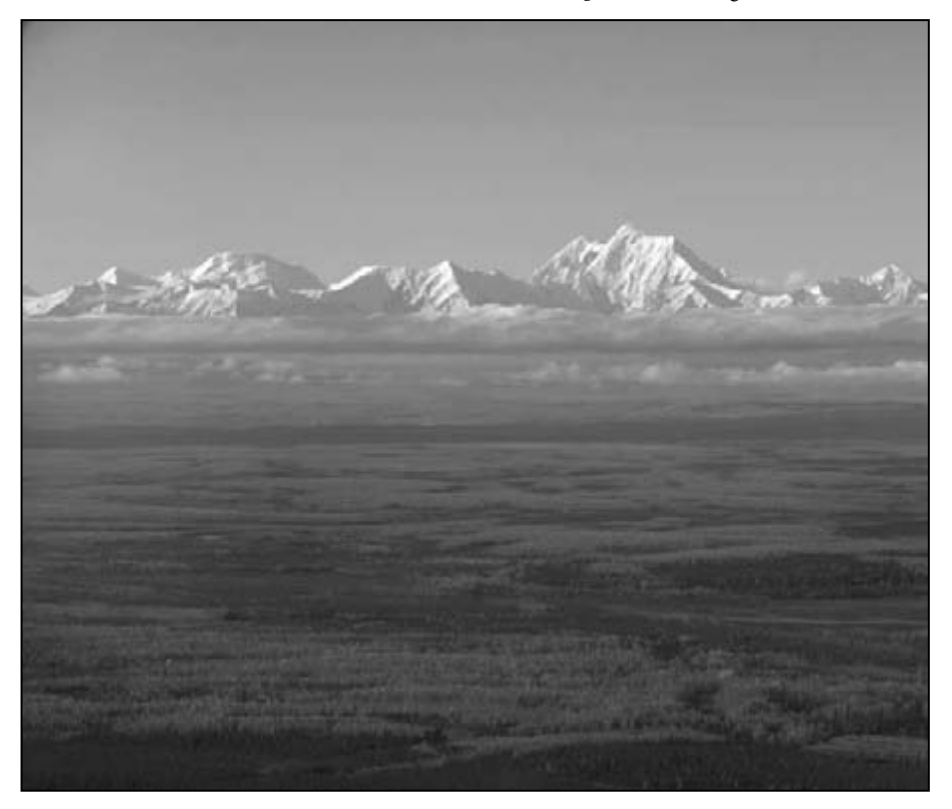
Figure 1. Aerial view of interior forests.

The surveys we conduct provide only a sampling of the forests via flight transects. Unlike many other areas in the United States, full 100 percent coverage of forested lands in Alaska is not possible. The short Alaska