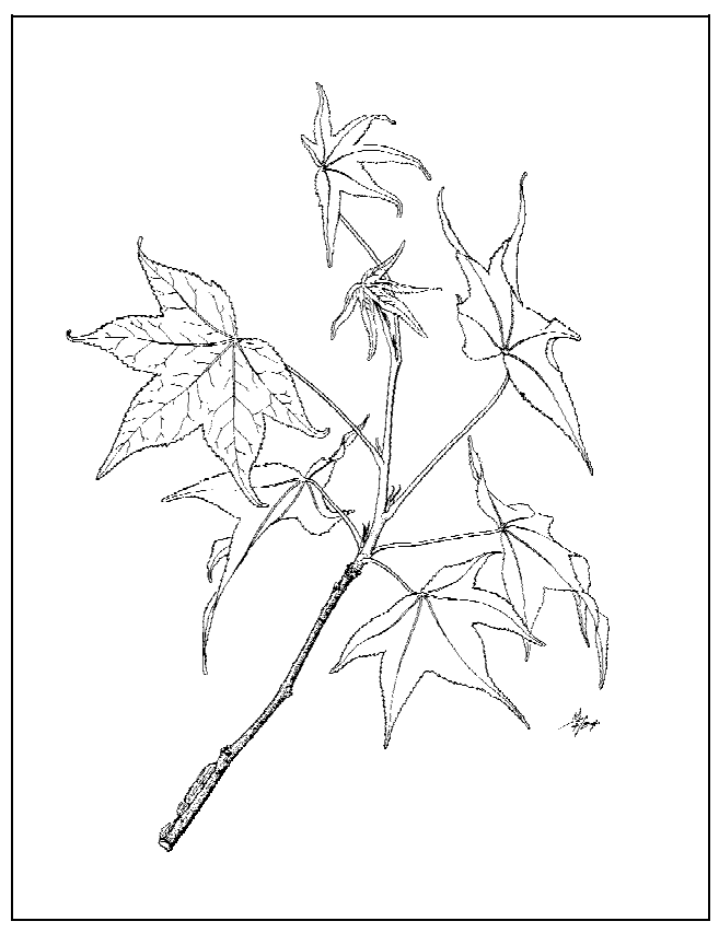
Figure 3. Foliage of 'Burgundy' Sweetgum.