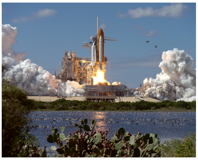
NASA will return the Space Shuttle to flight to complete assembly of the International Space Station. Safety remains the agency's highest priority.

The Space Shuttle has served as the centerpiece of the Nation's human space flight program for more than 20 years. This vehicle is the workhorse for Space Station assembly and remains instrumental for the laboratory's completion. Consequently, NASA will return the Shuttle to service to complete the Space Station, doing so with safety as its top priority and based on the Columbia Accident Investigation Board's recommendations. But because the aging system remains costly to operate, lacks some safety capabilities that could be incorporated into future systems, and lacks the capability to fly beyond low Earth orbit, NASA plans to retire the Shuttle by the end of the decade, once its role in Space Station assembly is complete.