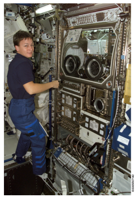
Space Station research will prepare humans to travel beyond low Earth orbit.

NASA continues to play an integral role in improving life on Earth. The agency's aeronautics program will enhance the safety, security, efficiency, and environmental impact of aviation. As one of the largest pieces of the interagency Climate Change Science Program, NASA's satellites, technologies, and research are contributing to the understanding and protection of Earth. NASA observations are helping to improve techniques to forecast the weather, monitor forest fires, and track the spread of pollutants. The Budget supports increased investments in the President's Climate Change Research Initiative, including investment in a critical satellite to help determine the impacts of aerosols such as soot and dust on global climate change. Also, NASA education programs continue to encourage students to enter science and engineering careers.