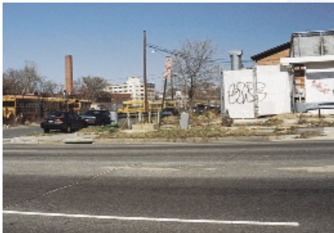
A deteriorating M Street will be renewed.

NCPC anticipates that the redevelopment energy from South Capitol and M streets will spill over to Poplar Point and Anacostia, two key segments of Legacy's proposed 22-mile urban waterfront. With its river setting, Metro connections and panoramic views of the Capitol, Poplar Point could be part of a new southern gateway to central Washington. Congress has already directed the National Park Service to prepare an interim plan for its 110 acres that includes numerous ball fields and tennis courts. As more people are attracted to the area, its future as a regional economic, cultural and educational center will brighten.