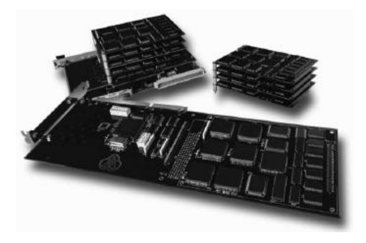
Accurate Automation's Neural Network Processor.

The neural network control system, designed and manufactured by Accurate Automation Corporation, is based on the company's successful Neural Network Processor (NNP®), also funded under the SBIR program. The NNP® is a multiple instruction/multiple data (MIMD) system that can be used in personal computers as well as aircraft.