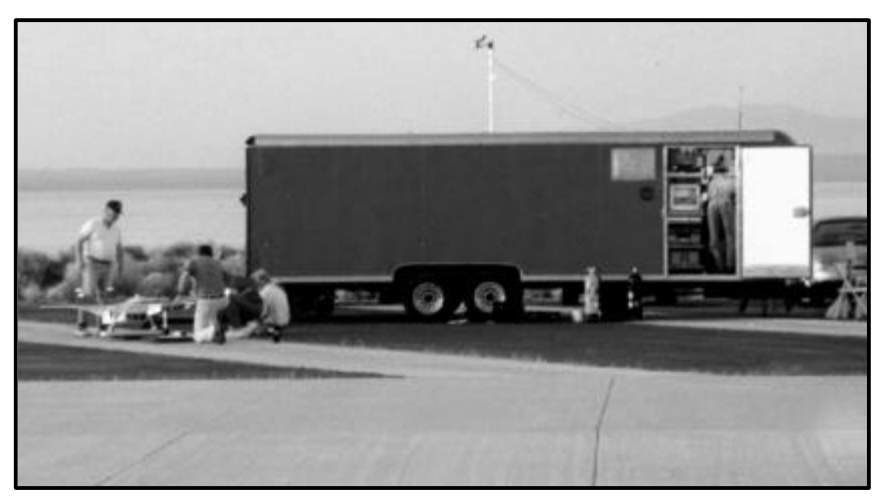
The LoFLYTE<sup>™</sup> Mobile Ground Control Station provides the flight test team with all of the facilities needed to conduct flight testing, including all aircraft maintenance and safety equipment, computers for telemetry and data recording, and a weather station.

Accurate Automation Corporation, of Chattanooga, Tennessee, was selected as the contractor for LoFLYTE<sup>TM</sup> under the NASA and U.S. Air Force Small Business Innovation Research (SBIR) Programs. The LoFLYTE<sup>TM</sup> RPV will eventually become an unmanned autonomous vehicle (UAV). The shape of LoFLYTE<sup>TM</sup> is based upon a high lift/drag Mach 5 configuration. The actual shape takes advantage of engine/body integration and was derived from a Mach 5 conical flowfield. The LoFLYTE<sup>TM</sup> vehicle demonstrates clearly how rapid prototyping can build flightquality hardware inexpensively. It also features onboard subsystems, including an advanced real-time airborne data acquisition and control system with 16 channels of analog