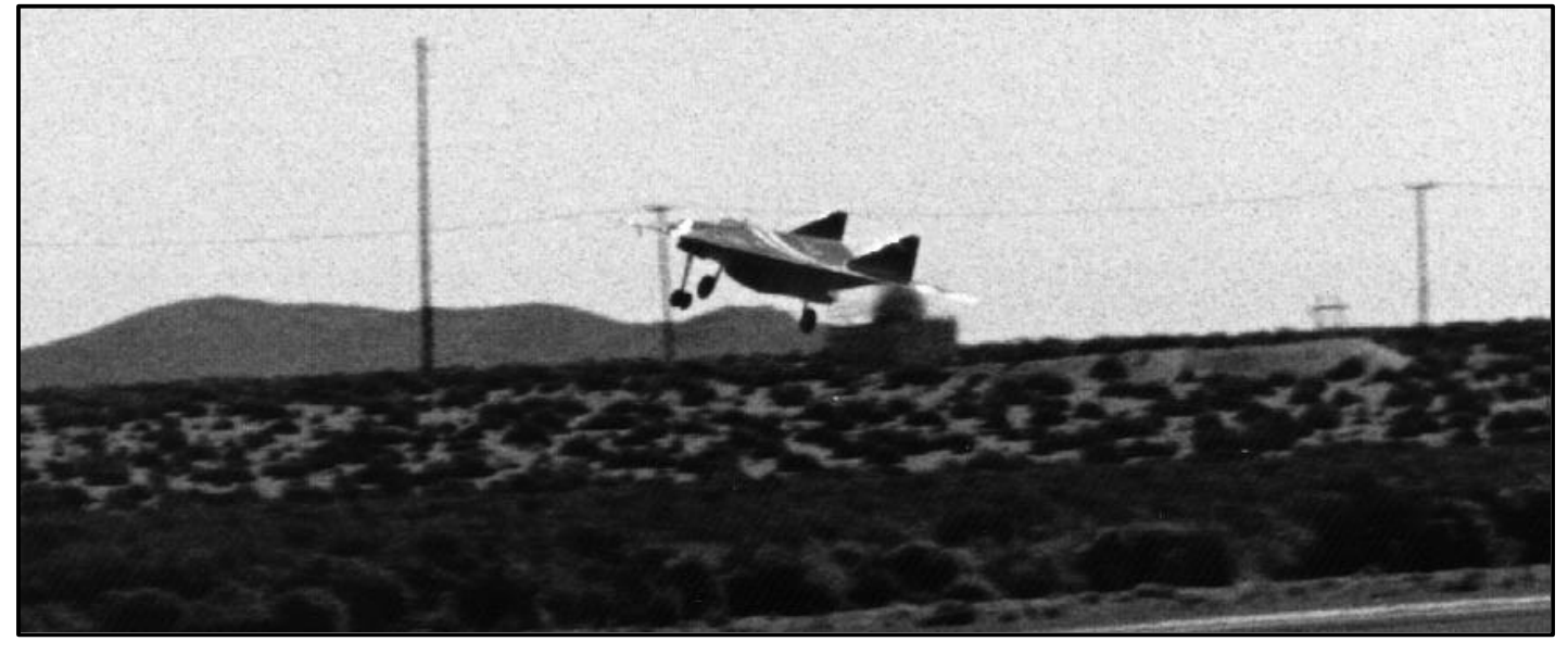
During the week of June 23, 1997, LoFLYTE<sup>™</sup> made three successful flights at Edwards Air Force Base under the direction of the 445th Flight Test Squadron. In the next stage of the program, a neural network flight control system will be installed and tested.

Flights Demonstrate Airworthiness of "Waverider" Shape