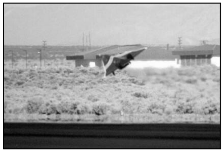
LoFLYTE<sup>™</sup> banks after take-off.

California, did water tunnel flow visualization tests and tested a 72-inch-long drop model.