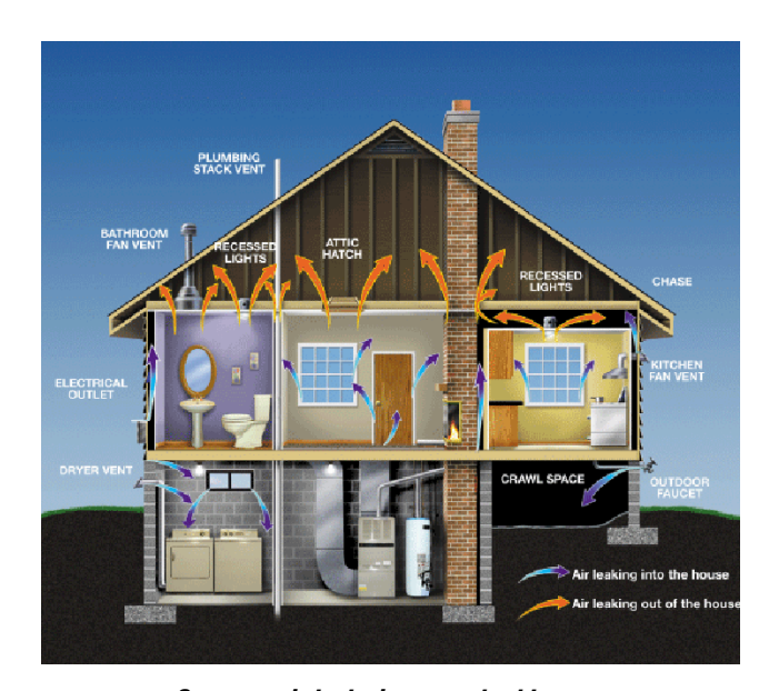
Common air leaks in a standard home

Increased Durability. When warm air leaks through a home's floors, walls, and attic, it can come in contact with cooler surfaces where condensation can occur. Moisture that occurs in these construction assemblies encourages mold growth, ruins insulation, and even compromises the structural elements of the home. Reducing air leakage helps minimize moisture problems and increase the home's durability.