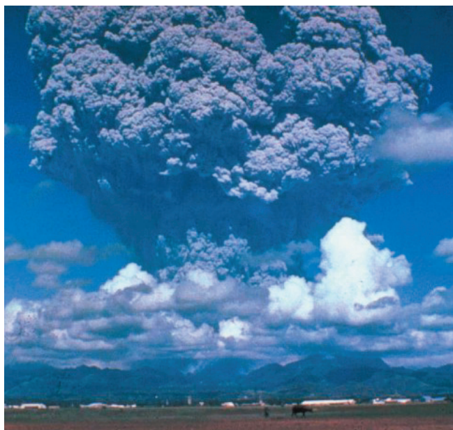
Ash plume from the eruption of Mt. Pinatubo in 1991.

The SAGE III instrument will measure the distribution of aerosols from the middle troposphere through the stratosphere. For example, the predecessor to SAGE III the SAGE II satellite instrument, launched in 1984, observed the dispersal of volcanic aerosols following the massive eruption of Mt. Pinatubo in 1991. These measurements were crucial in linking a decline in the globally averaged surface temperature in mid-1992 of about 1 degree Fahrenheit to the large aerosol concentrations from the volcanic eruption. Aerosols from Mt. Pinatubo also strongly influenced the observed ozone trend— an effect that would not have been detected without measurements like those from SAGE II. The data provided unique insight into the complex flow of air in the stratosphere that is needed to gain a better understanding of how the upper atmosphere will respond to climate change.