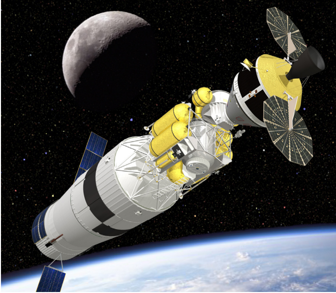
Concept image of the Ares V Earth departure stage in orbit, shown with the Orion crew module docking with the lunar lander module and Earth departure stage.

translunar injection. This second burn will last approximately 442 seconds to accelerate the mated vehicles to “escape velocity,” the speed necessary to break free of Earth’s gravity and travel to the moon. Then, the Orion-lunar lander combination will perform a final maneuver to jettison the Earth departure stage and its J-2X engine and place them in orbit around the sun.