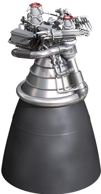
Concept image of the J-2X engine.

The launch vehicle's second, or upper, stage is powered by the J-2X engine. The J-2X will ignite approximately 126 seconds after liftoff, following separation of the vehicle's first stage, which occurs at an altitude of about 194,000 feet (37 miles). The engine will operate for approximately 465 seconds, long enough to burn more than 102,600 gallons (302,200 pounds) of propellant. It will shut down just as the Ares I upper stage reaches an altitude of 425,000 feet (80.5 miles).