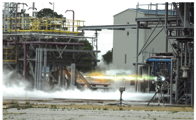
Subscale main injector hardware hot-fire testing at Marshall in June 2006.

Engineers at NASA’s Marshall Center conducted hot-fire tests on subscale injector hardware in 2006 as part of an effort to investigate design options that would maximize performance of the J-2X engine for the Ares upper stages. The initial tests were performed on a variety of subscale injector designs. Data gathered from the tests is being used to design and develop the full-scale J-2X injector. Additional tests are planned.