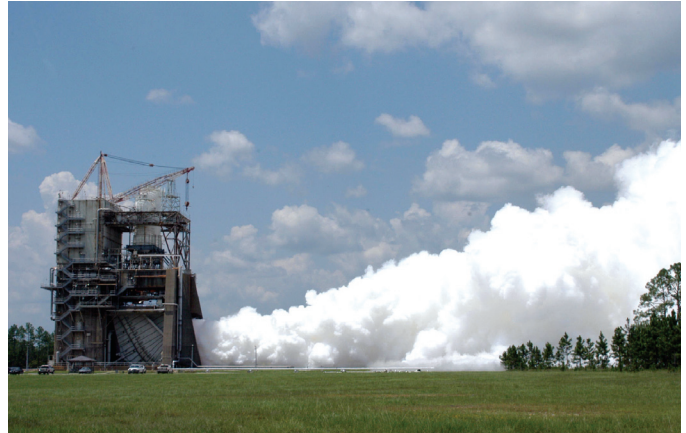
NASA conducts the last space shuttle main engine test on the Stennis A-1 Test Stand Sept. 29, 2006. The stand was transferred to the Constellation Program in November 2006.

Tests of the J-2X power pack and gas generator are planned for 2007. The test series will be conducted on the A-1 Test Stand at NASA's Stennis Space Center in Bay St. Louis, Miss. The test stand was built in the 1960s to test rocket engine stages for the Apollo Program. It was modified in the 1970s to test-fire and prove the flight readiness of all main engines for NASA's space shuttle fleet. The first integrated J-2X engine systems test is scheduled for 2010.