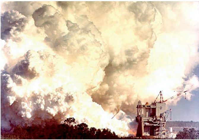
Test firing of a Saturn V second stage rocket in April 1966. The rocket used a cluster of five J-2 engines.