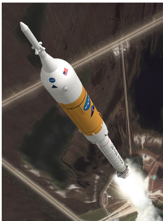
Concept image of launch of Ares I.

Ares I has two missions: lofting up to six astronauts (or cargo) to the International Space Station—approximately 52,000 pounds—or