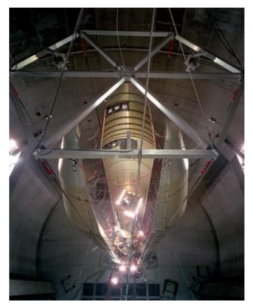
Titan IV payload fairing in NASA Glenn's Space Power Facility, located at Plum Brook Station in Sandusky, Ohio.

NASA Glenn's involvement began 8 years before the launch. In 1990, Glenn was involved in the jettison testing of the Titan IV payload fairing. This was a cooperative effort of the USAF, the Martin Marietta Company (now Lockheed Martin Corporation), and NASA. The Titan IV's 86-ft-tall, 16-ft-diameter fairing, the largest payload fairing ever tested in a vacuum chamber, had internal dimensions about the size of the space shuttle payload bay. To accommodate the fairing's great size, researchers conducted