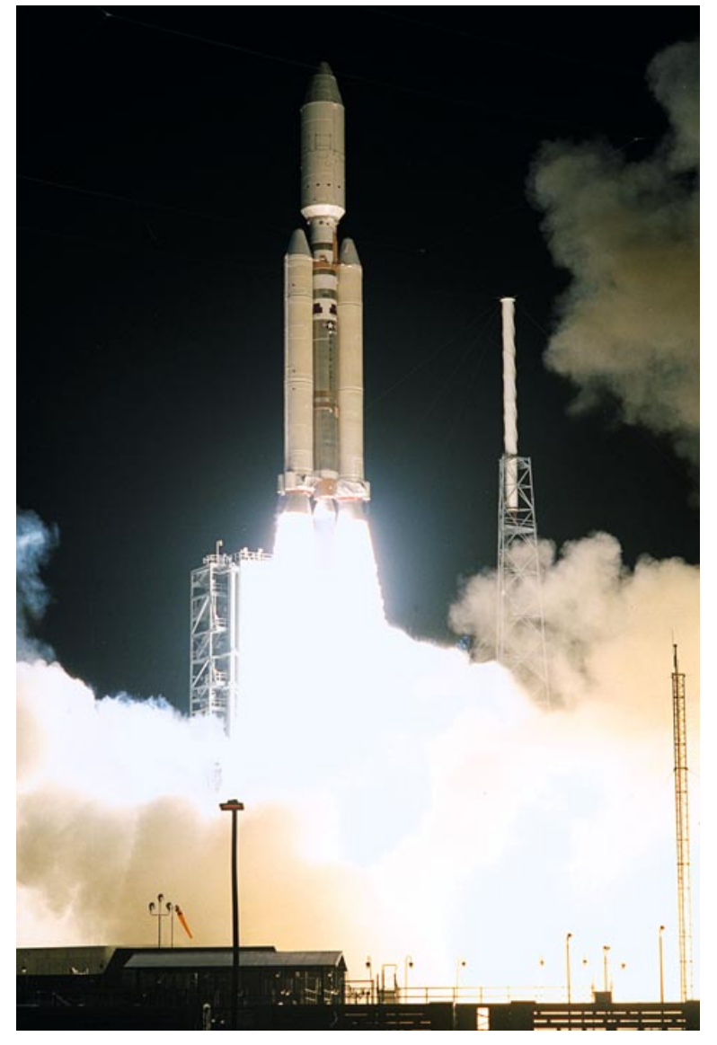
U.S. Air Force Titan IV-B33 launches the Cassini spacecraft on October 15, 1997.

Unlike the almost routine launches of communications satellites and the shuttles, this launch was complicated by (1) the great distance that Cassini will travel to reach Saturn (3.2 billion kilometers, or 2 billion miles), (2) the spacecraft's great complexity and size (as tall as a two-story building and heavier than a large African elephant), and (3) the special measures that were necessary to safeguard its interplanetary power source. To lift this heavy payload, the launch team used the Titan IV–B, the Nation's largest, most powerful, and newest heavy-lift expendable launch vehicle. This mammoth rocket is as